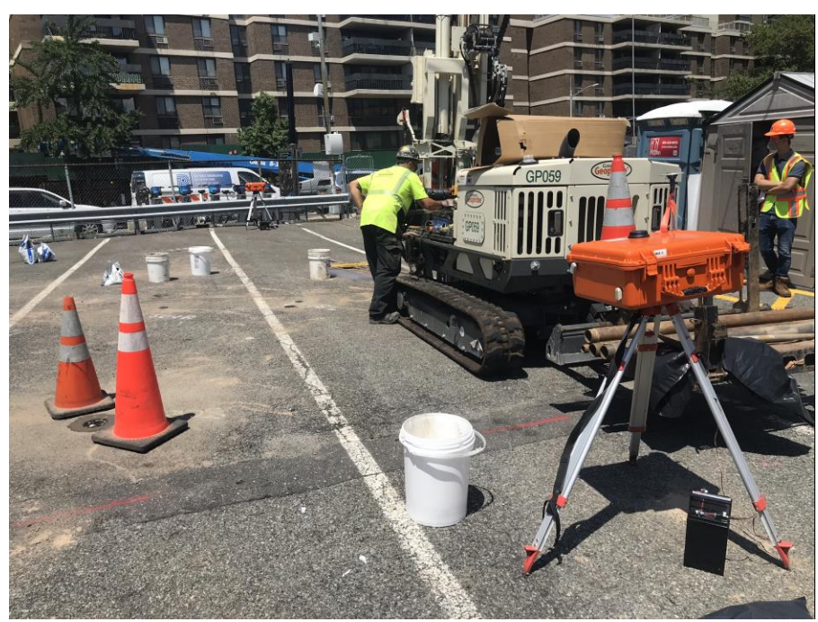
Photo 1: AARCO advancing soil boring SB4E2 in the northern part of the site (facing north)