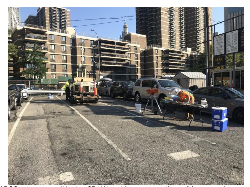
Photo 4: AARCO advancing soil boring SB4N1 and Langan sampling soil in the northern part of the site (facing north)