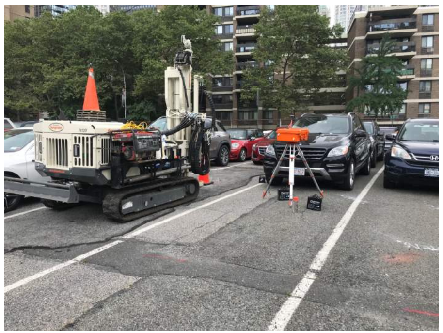
Photo 2: AARCO installing sub-slab vapor probe at Void 5 (facing north)