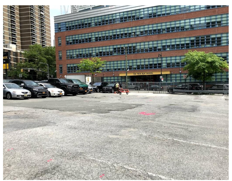
Photo 1: Hager-Richter using an EM61-MK2A Metal Detector in the northeastern part of site (facing northeast)