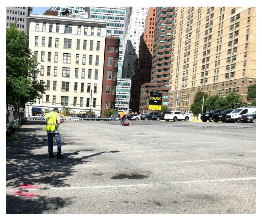
Photo 2: Hager-Richter using a GPR Scanner in the southeastern part of the site (facing southwest)