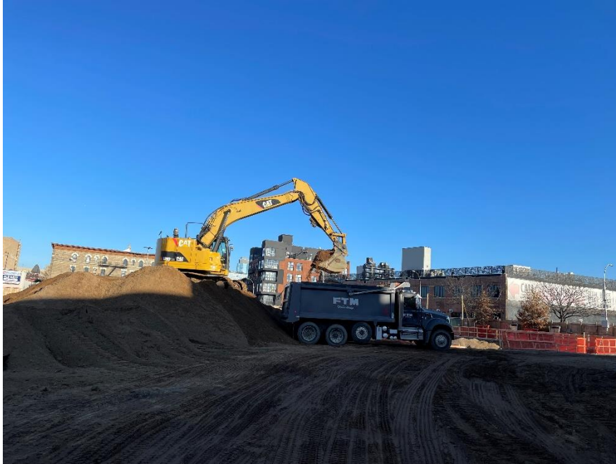
Photo 1: View of soil loading for disposal on Lot 14, facing east.