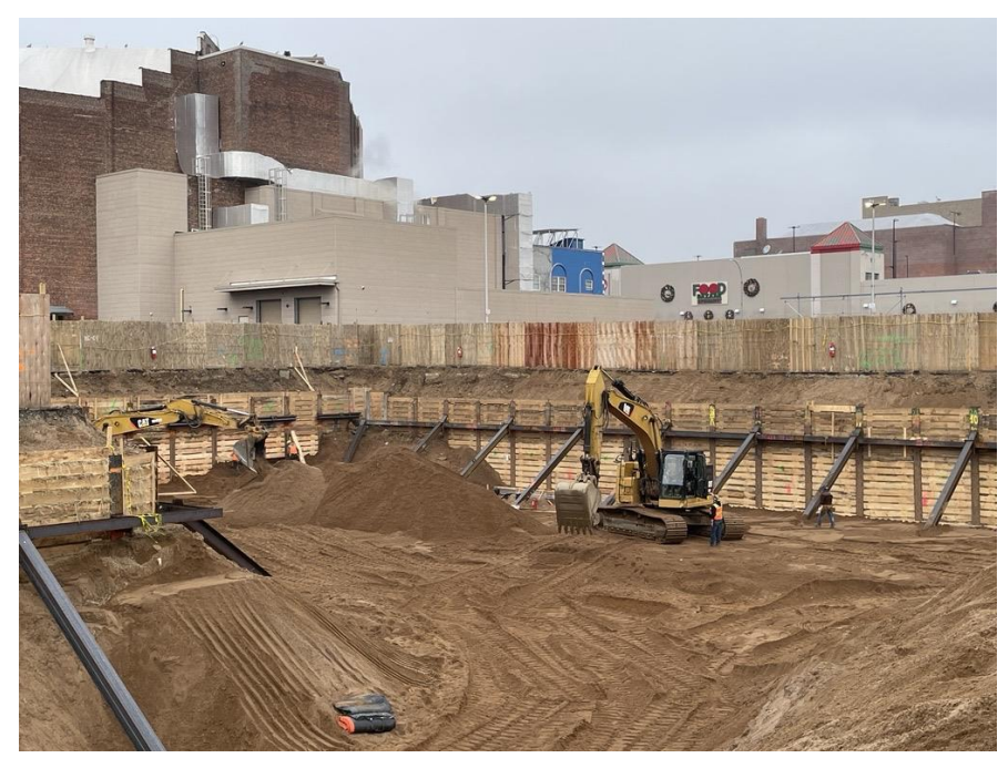
Photo 1: View of SOE activities on Lot 14, facing north-northwest.