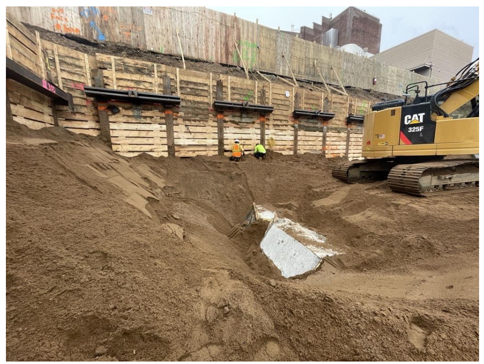
Photo 2: View of contractor SOE installation in Lot 14, facing north-north east.