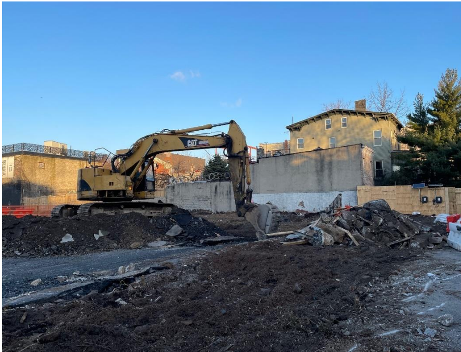
Photo 2: View of contractor stockpiling asphalt and C&D in Lot 53, facing north.