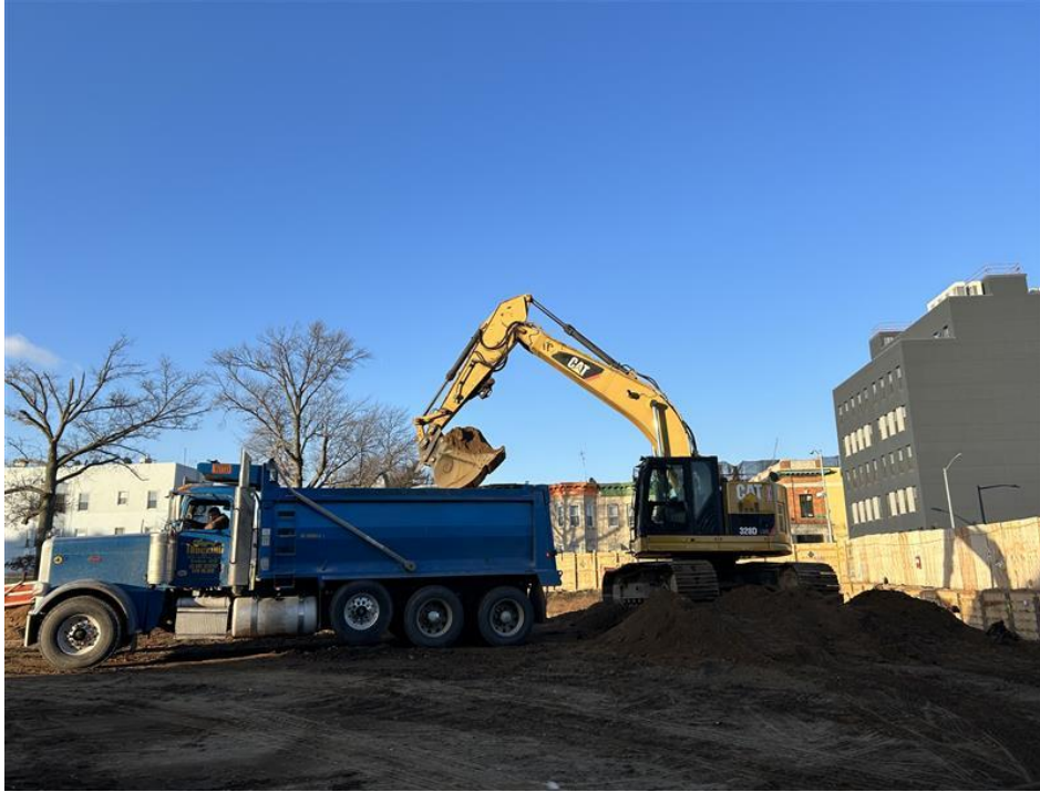
Photo 1: View of contractor loading soil for off-site disposal on Lot 14, facing west.