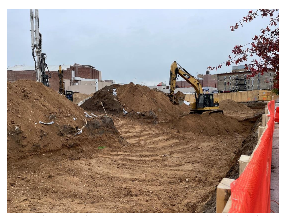
Photo 2: View of excavation for SOE installation along the perimeter of Lot 14, facing north.