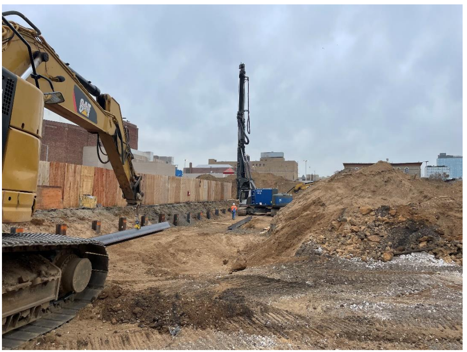
Photo 1: View of contractor installing H piles in Lot 14, facing north-northwest.