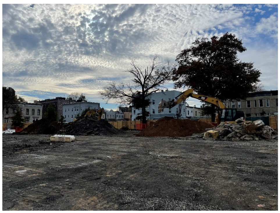
Photo 1: View of excavation for SOE installation along the perimeter of Lot 14, facing southwest.