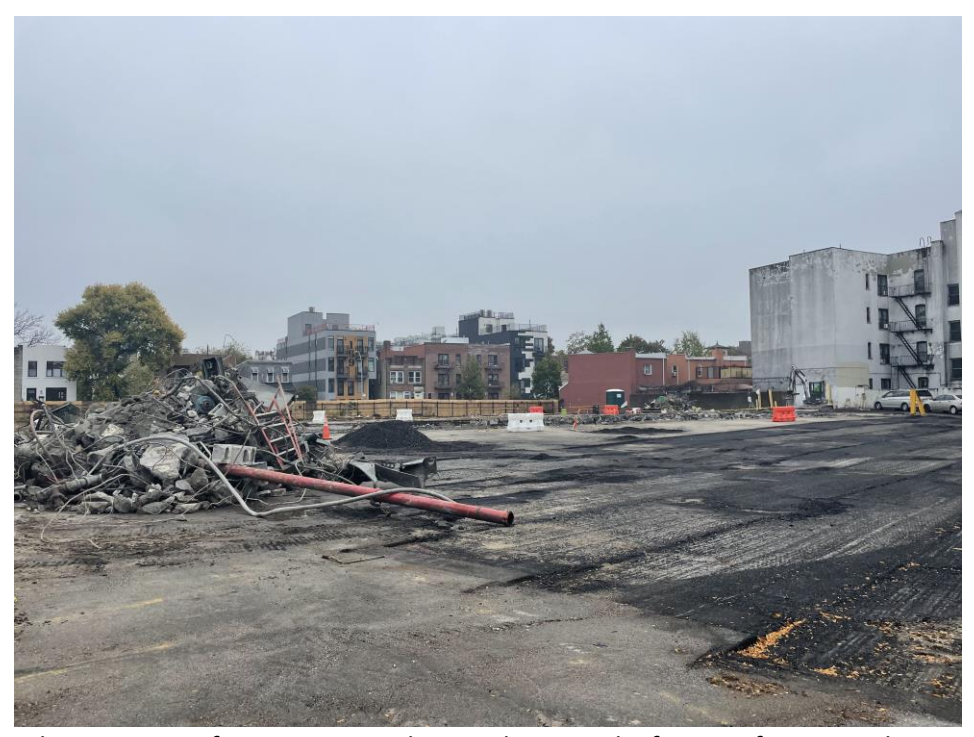
Photo 2: View of contractor conducting demo work of Lot 53, facing southeast.