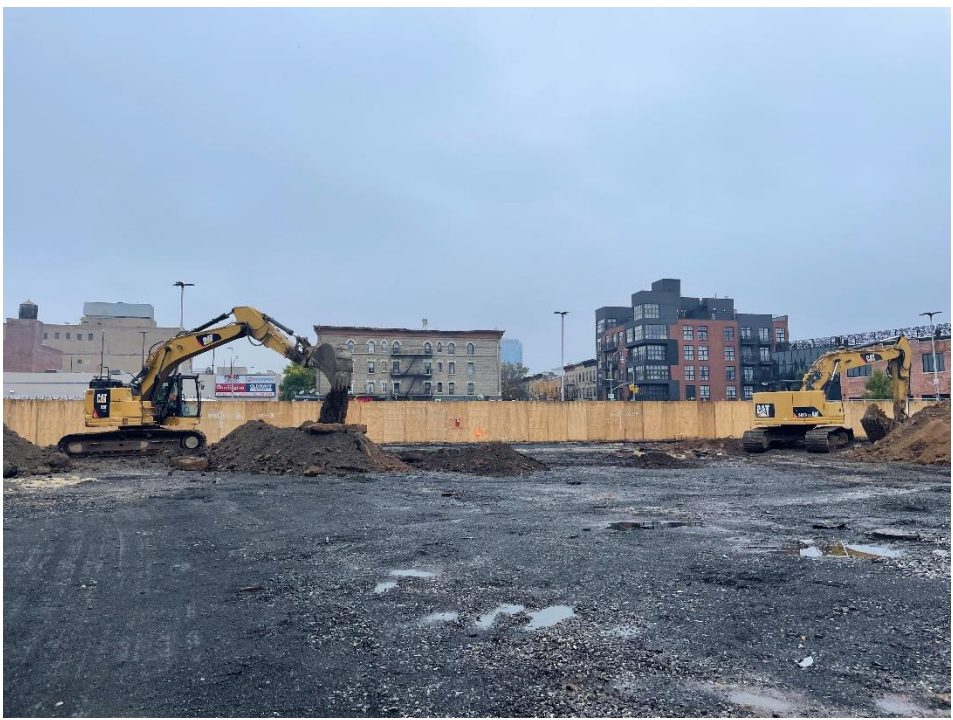
Photo 1: View of excavation for SOE installation along the perimeter of Lot 14, facing north.