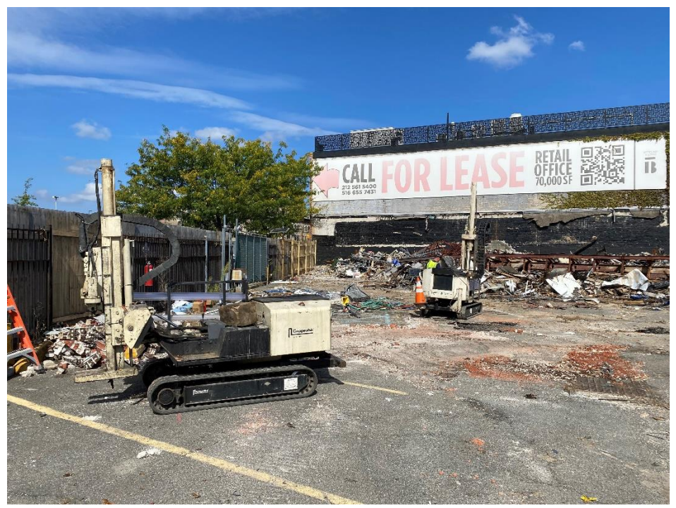
Photo 2: View of waste characterization soil boring activities, facing north.