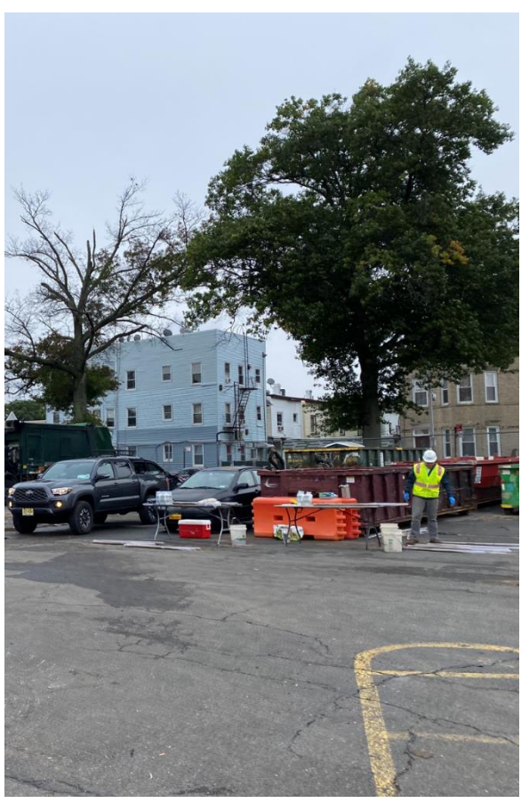
Photo 1: View of work station and soil sampling activities, facing west.