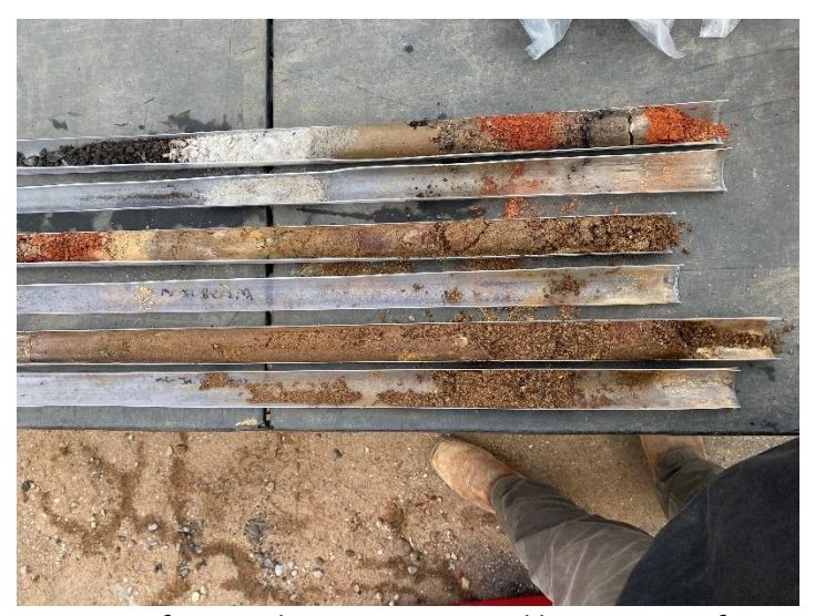
Photo 2: View of waste characterization soil boring cores, facing east.