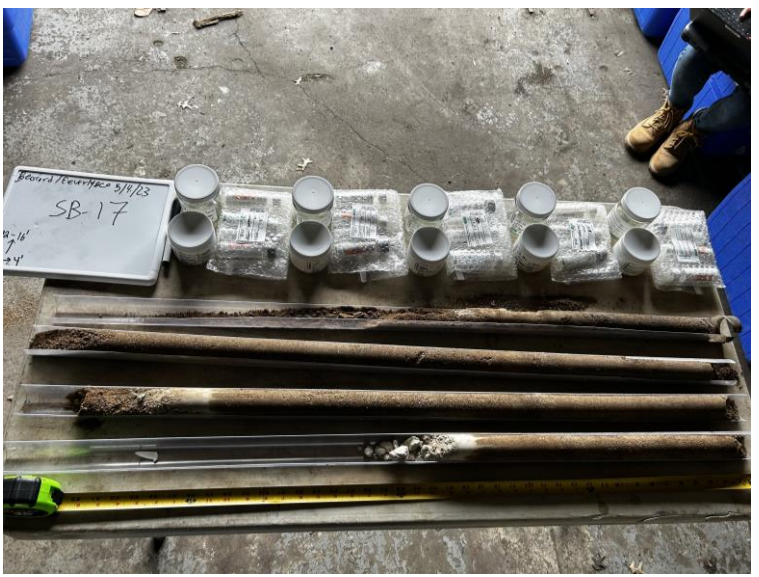
Photo 1: View of soil from SB-17 from 0-16 feet below grade surface, facing east.