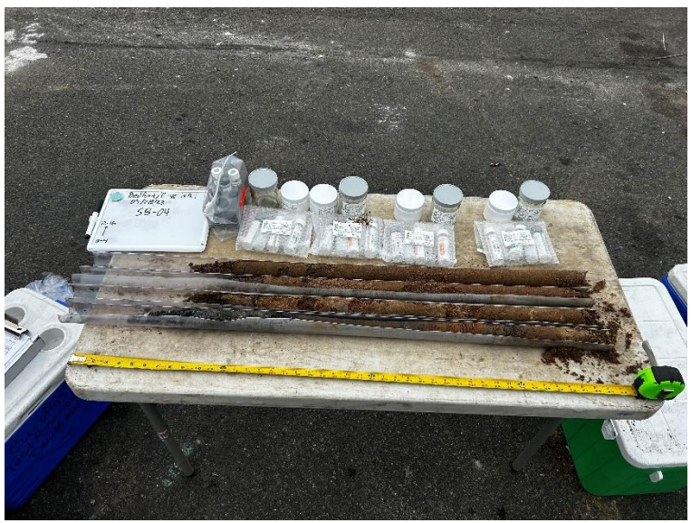
Photo 1: View of soil from SB-04 from 0-15 feet below grade surface, facing east.