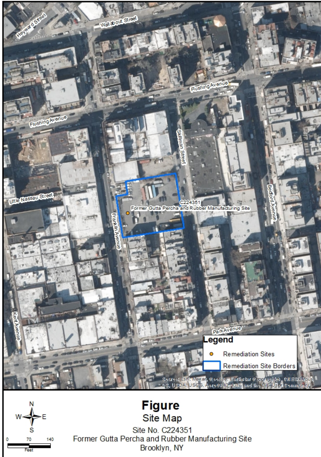
EXHIBIT A SITE MAP