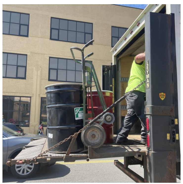
Photo 1: IWT loading drums of non-hazardous soil/fill for transport to CENJ (facing south)