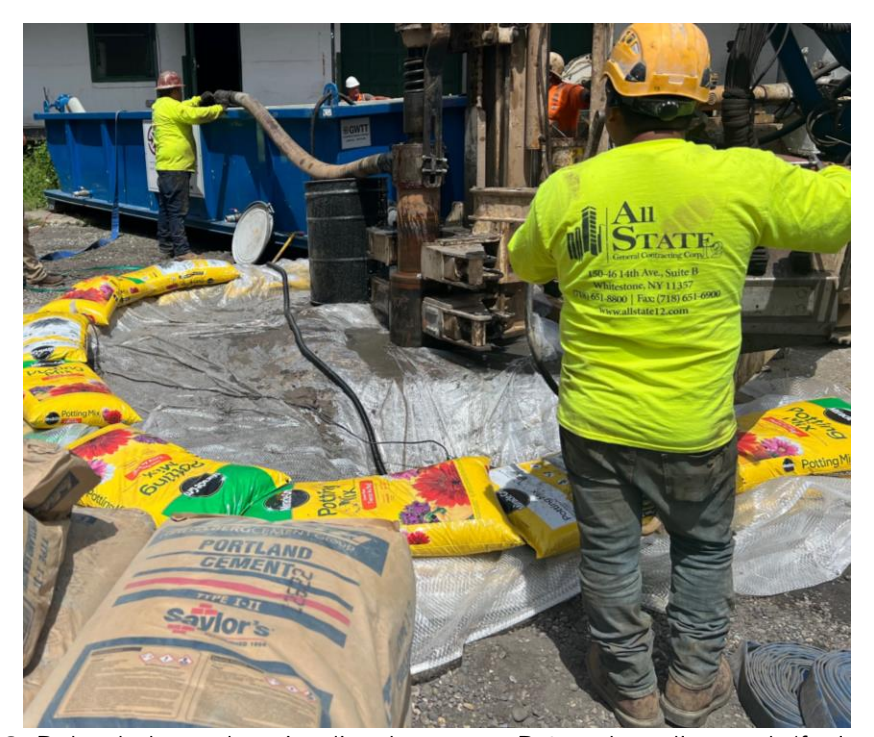
Photo 2: Polyethylene sheeting-lined sump at P-1 and settling tank (facing north)