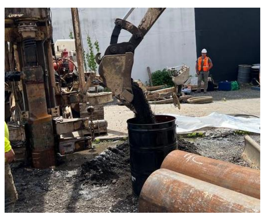
Photo 1: Allstate 12 excavating temporary sump and placing soil/fill into drums (facing east)