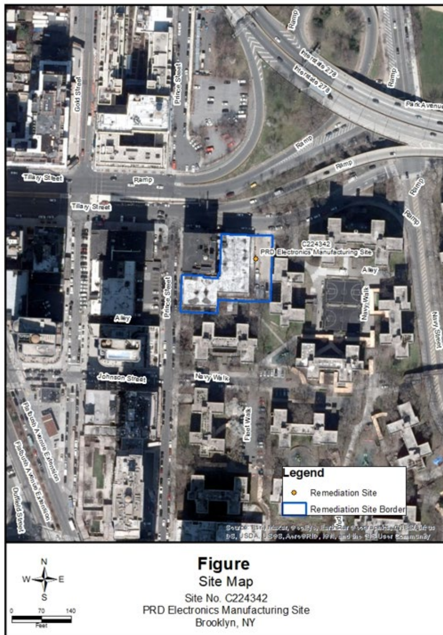
EXHIBIT A SITE MAP