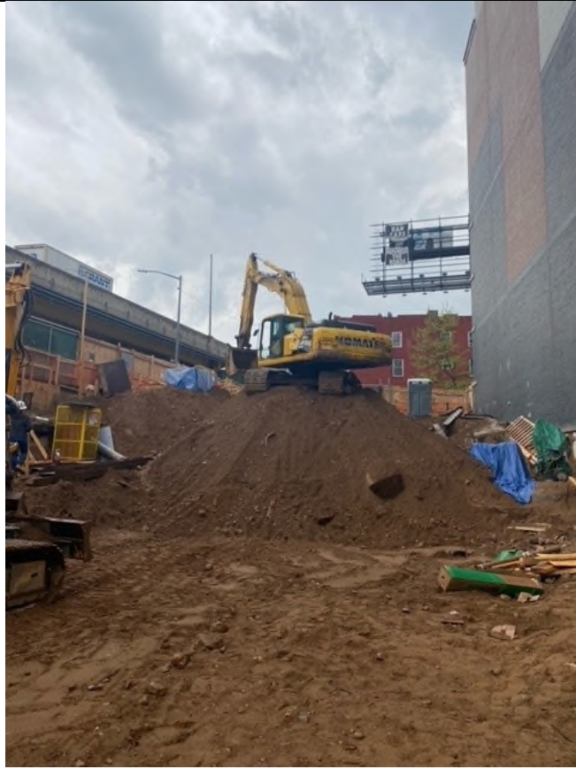
Photo 4 – Facing South GZA collected EP-7 at the southern portion of the Site.