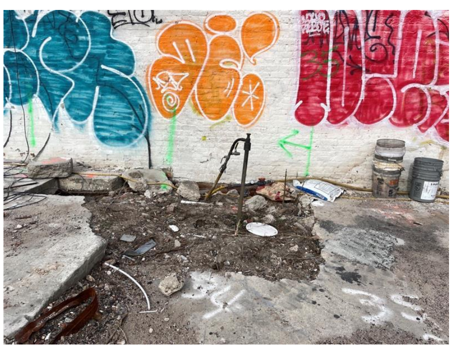
Photo 1: Regenesis applying remedial products at injection point IP35 (facing north).