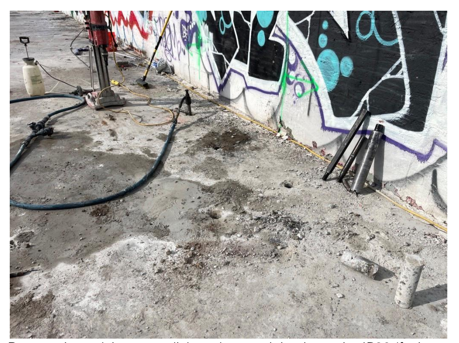
Photo 2: Regenesis applying remedial products at injection point IP30 (facing northwest).