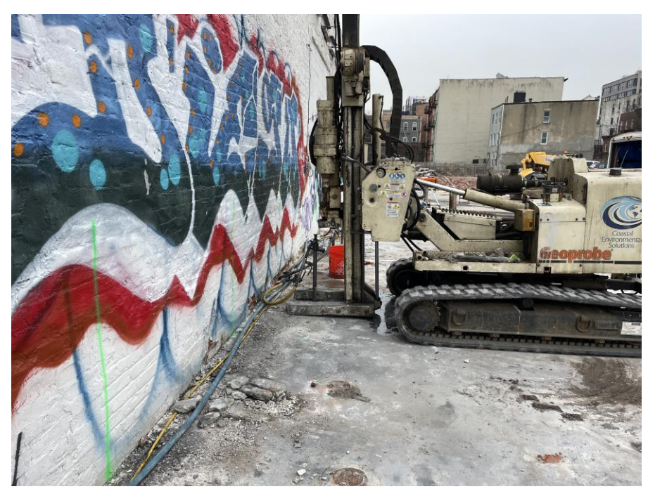
Photo 1: Regenesis applying remedial products at injection point IP27 (facing east).