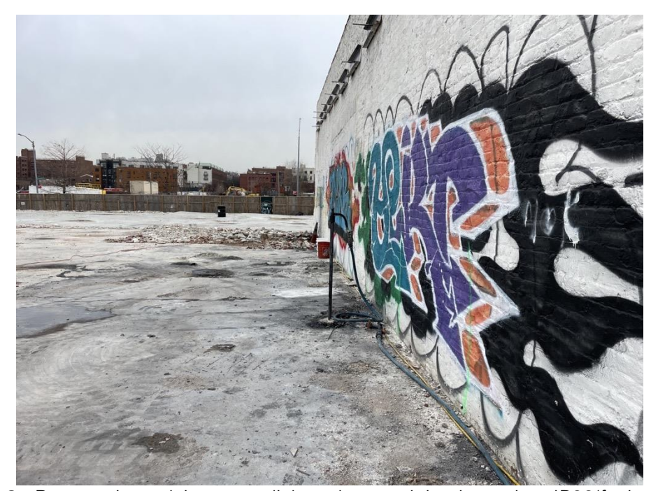
Photo 2: Regenesis applying remedial products at injection points IP22(facing west).