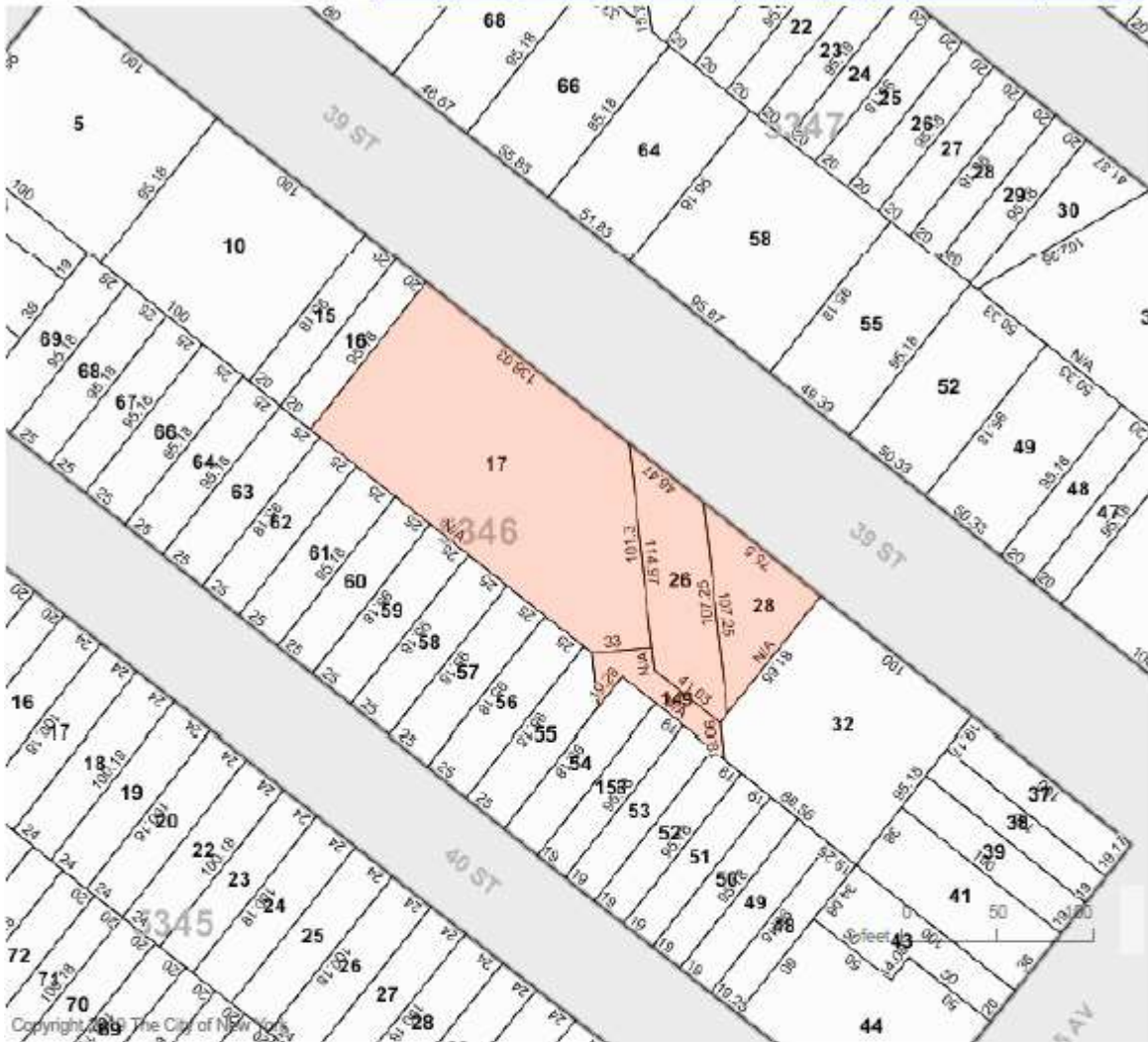
EXHIBIT A SITE MAP