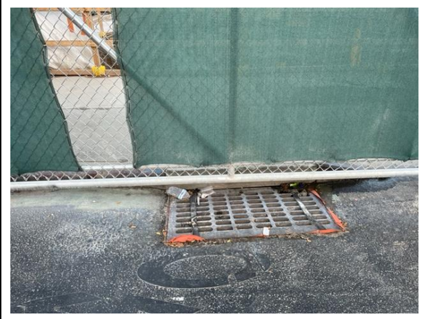
A view of catch basin on the eastern side with protective mesche.