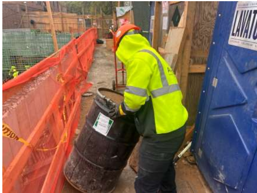
Photo 1: AARCO exporting a 55-gallon drum containing purged groundwater from the site (facing west).