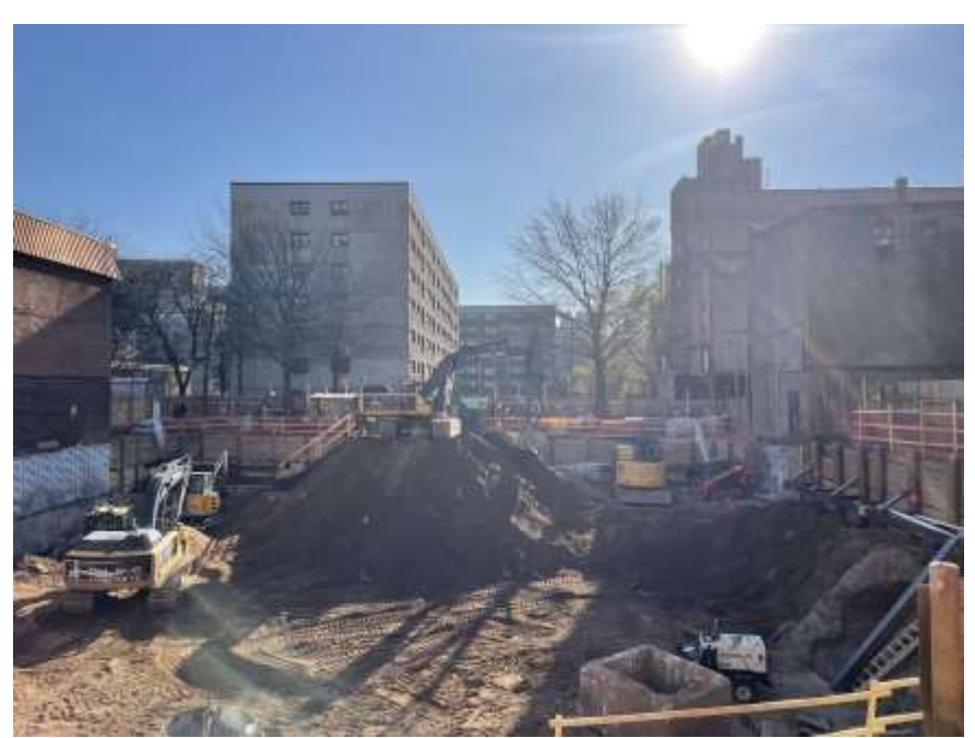
Photo 1: View of Rise live-loading non-hazardous fill into permitted tri-axle trucks for off-site disposal (facing south).