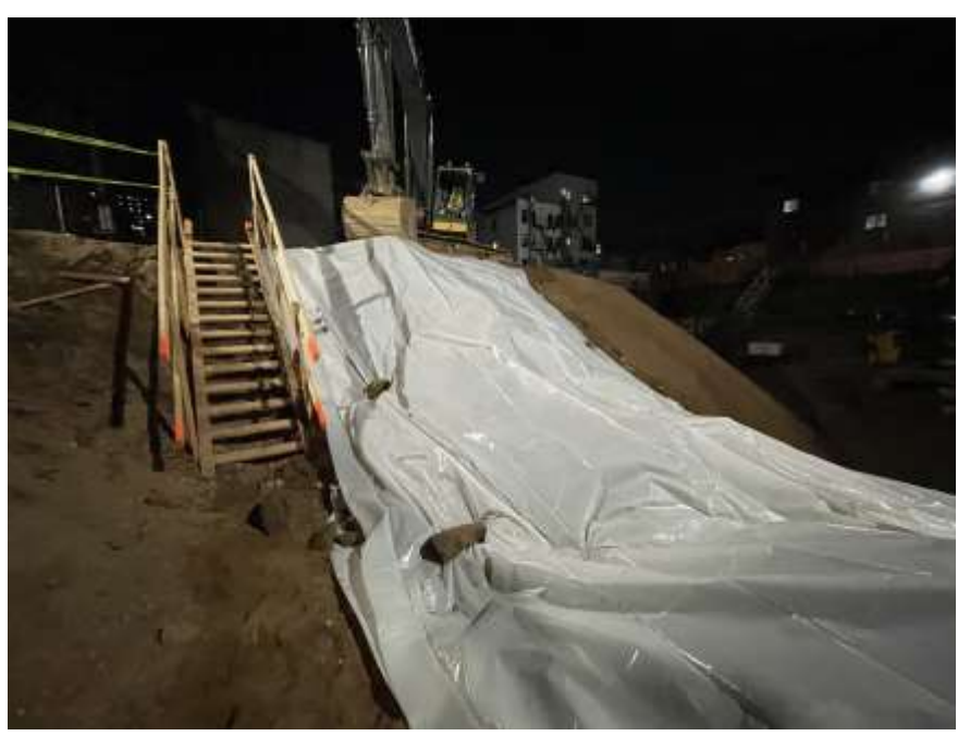
Photo 3: View of stockpiled hazardous lead contaminated soil on top of and covered with polyethlyene sheeting in the southeastern part of the site (facing west).