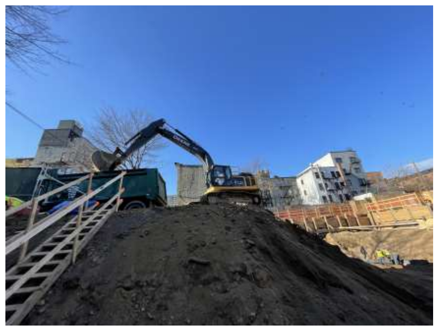
Photo 2: View of Rise live-loading non-hazardous fill/soil into permitted tri-axle trucks for off-site disposal (facing west).