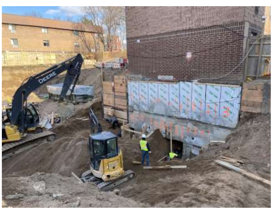
Photo 1: View of Rise excavating native soil for SOE underpinning installation (facing northeast).