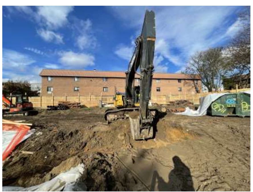
Photo 1: View of Rise excavating hazardous lead contaminated fill in the northeastern part of the site (facing north).