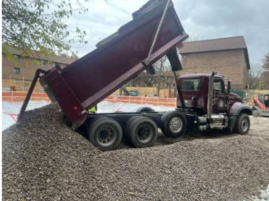
Photo 1: View of 3/4-inch RCA imported for construction of the temporary equipment ramp in the central part of the site (facing northeast).