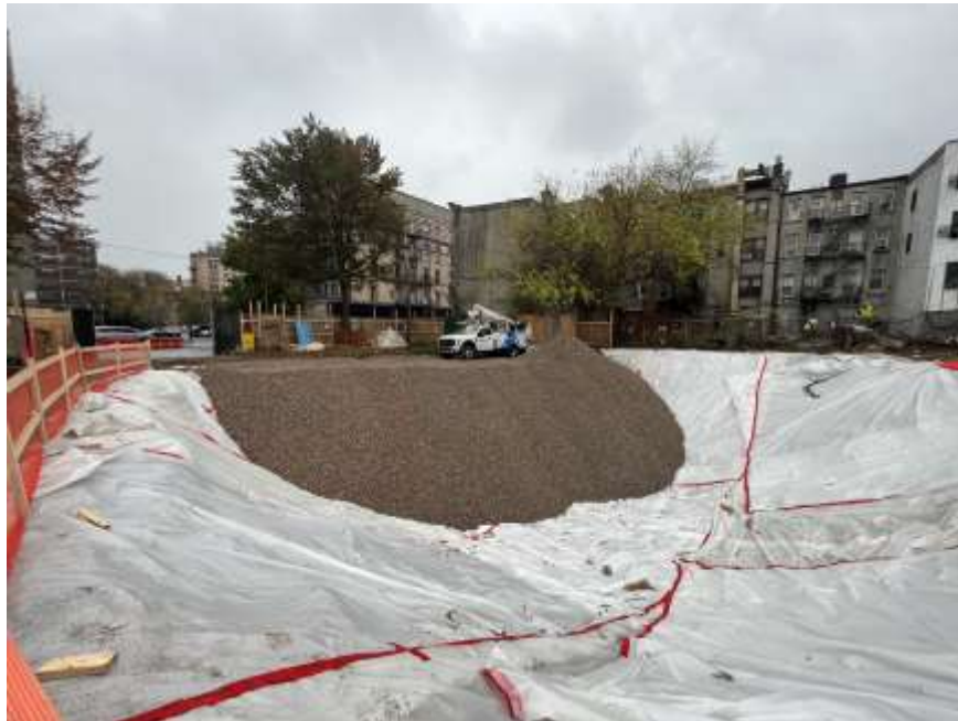
Photo 2: General view of the site at the end of the work day (facing southwest).