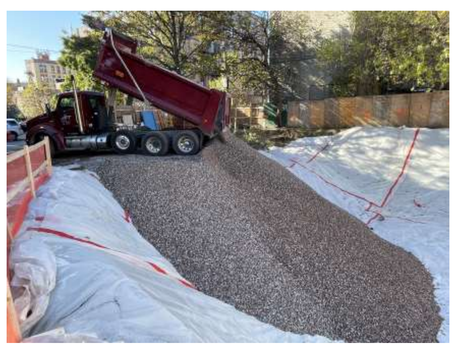
Photo 1: View of Rise importing 34-inch RCA imported for construction of the temporary equipment ramp in the central part of the site (facing southwest).