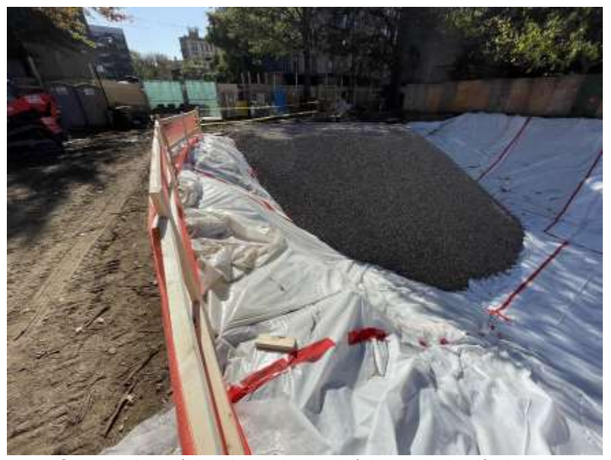
Photo 2: General view of the site at the end of the work day (facing southwest).