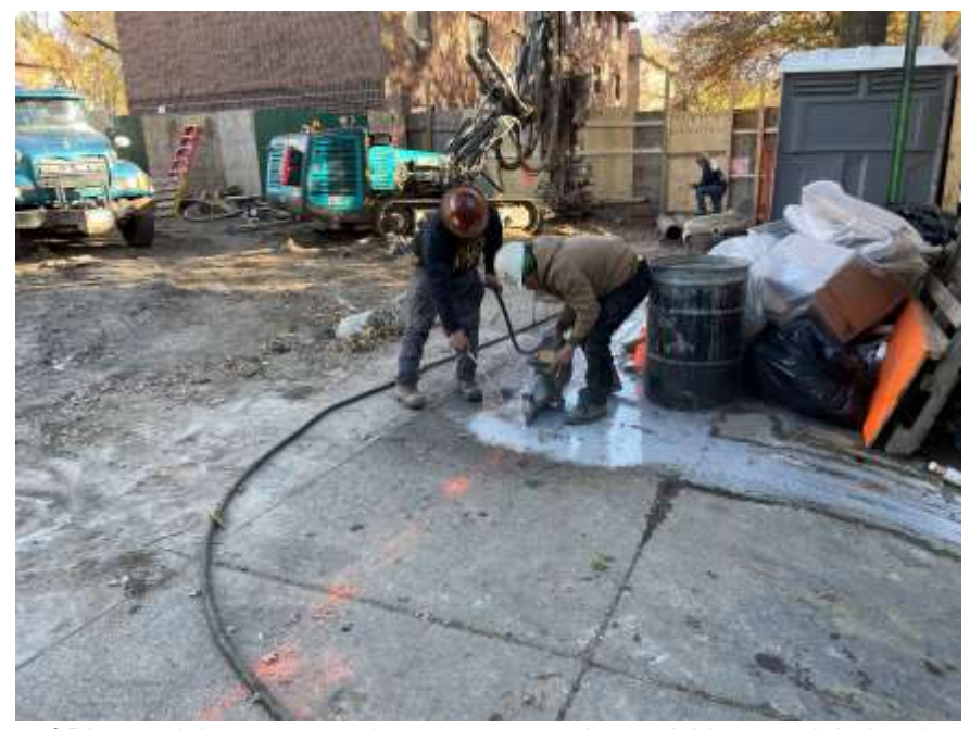
Photo 2: View of Rise applying water to the concrete sawing activities to minimize dust (facing east).