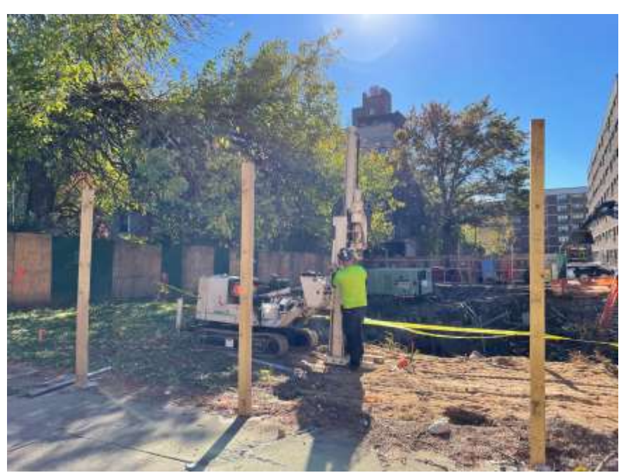
Photo 1: View of Lakewood advancing a soil boring in the southwestern part of the site (facing northwest).