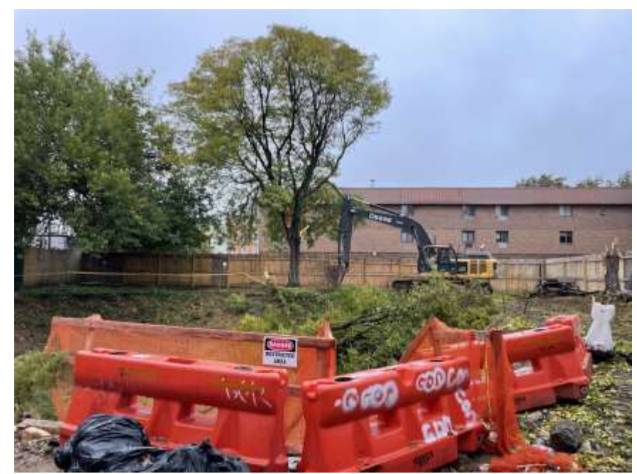
Photo 2: View of SD Builders removing trees in the northern part of the site (facing north).

Photo 1: View of SD Builders placing trees into a roll-off container for future off-site disposal (facing north).