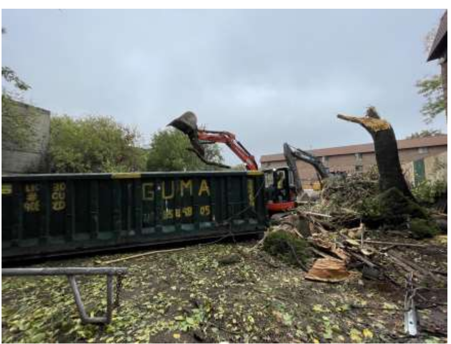
Photo 1: View of SD Builders placing trees into a roll-off container for future off-site disposal (facing north).