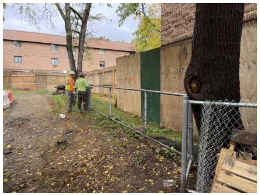
Photo 2: View of SD Builders removing chain-link fence along the eastern perimeter of the site (facing north).