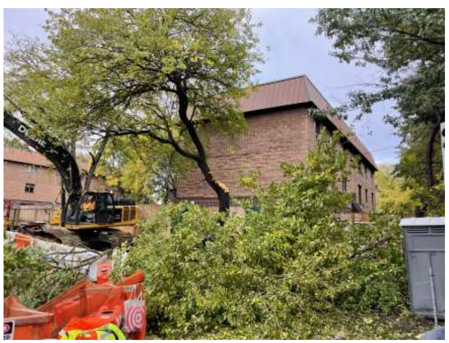
Photo 1: View of SD Builders removing trees in along the eastern pereimnter of the site (facing east).