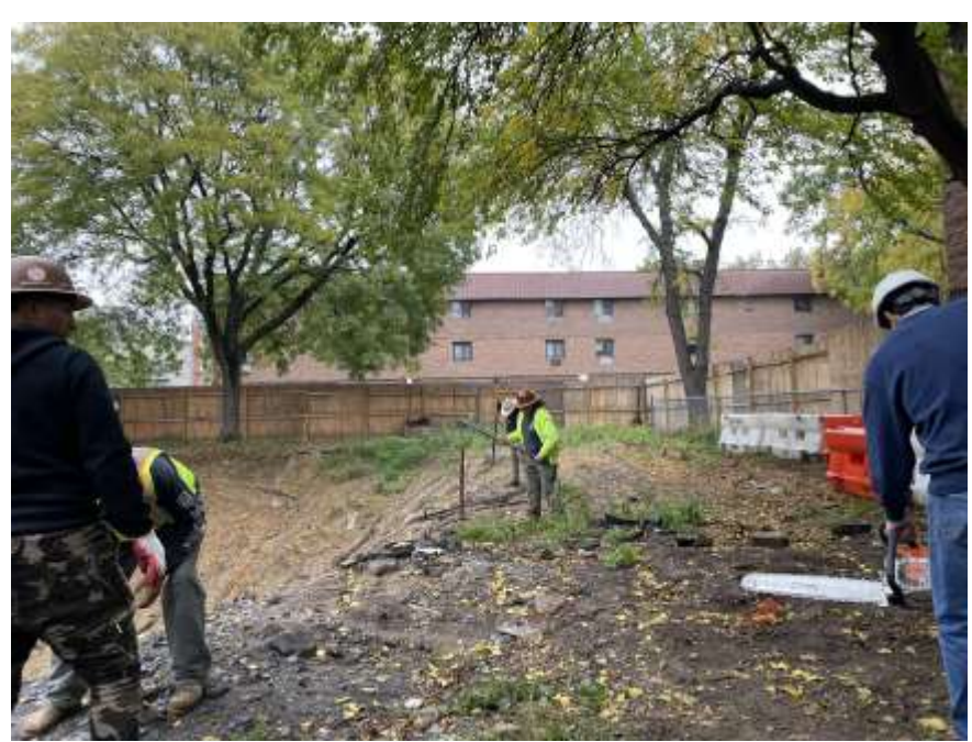
Photo 1: View of SD Builders installing a safety barrier around the existing excavated area of the site (facing north).