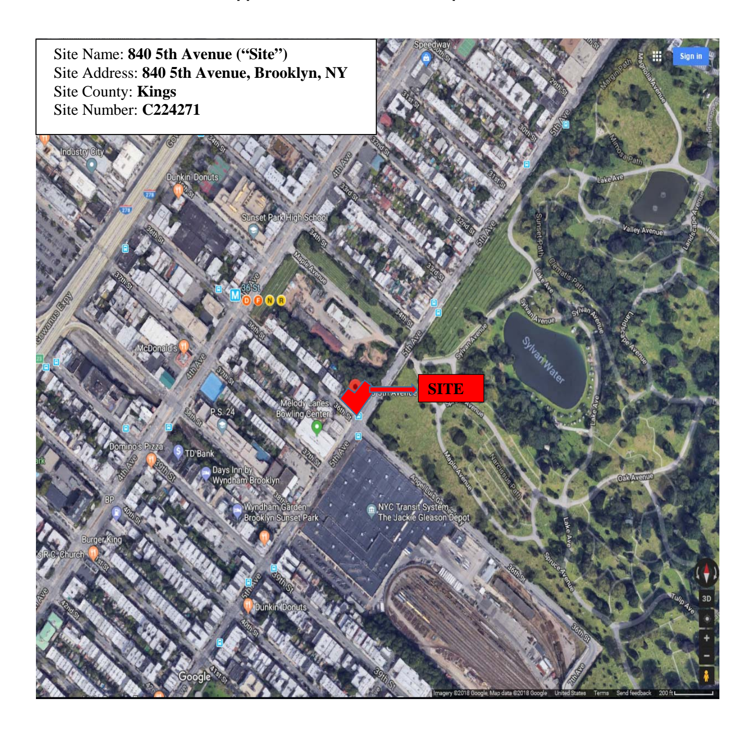
Appendix C - Site Location Map