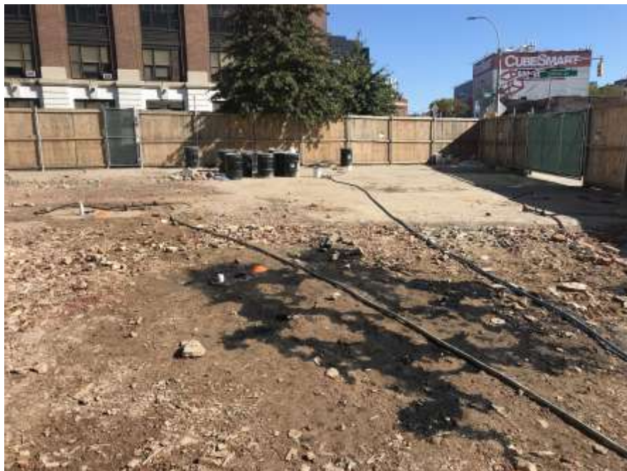
Photo 2: Regenesis injection hoses connected to IP-03, IP-05, IP-06, and IP-13, facing east.