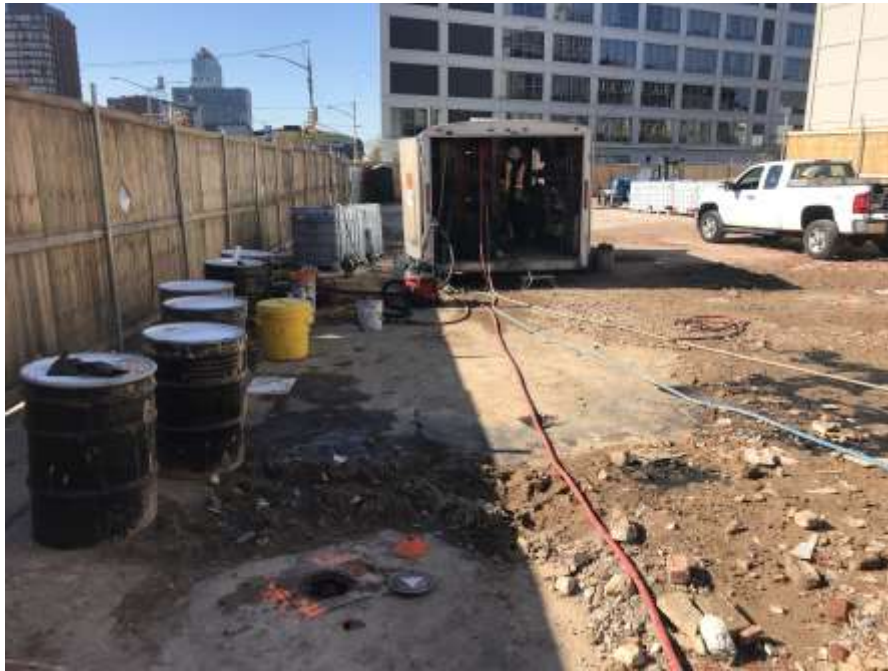
Photo 1: Regenesis trailer and injection hoses connected to IP-03, IP-05, IP-06, and IP-13, facing west.