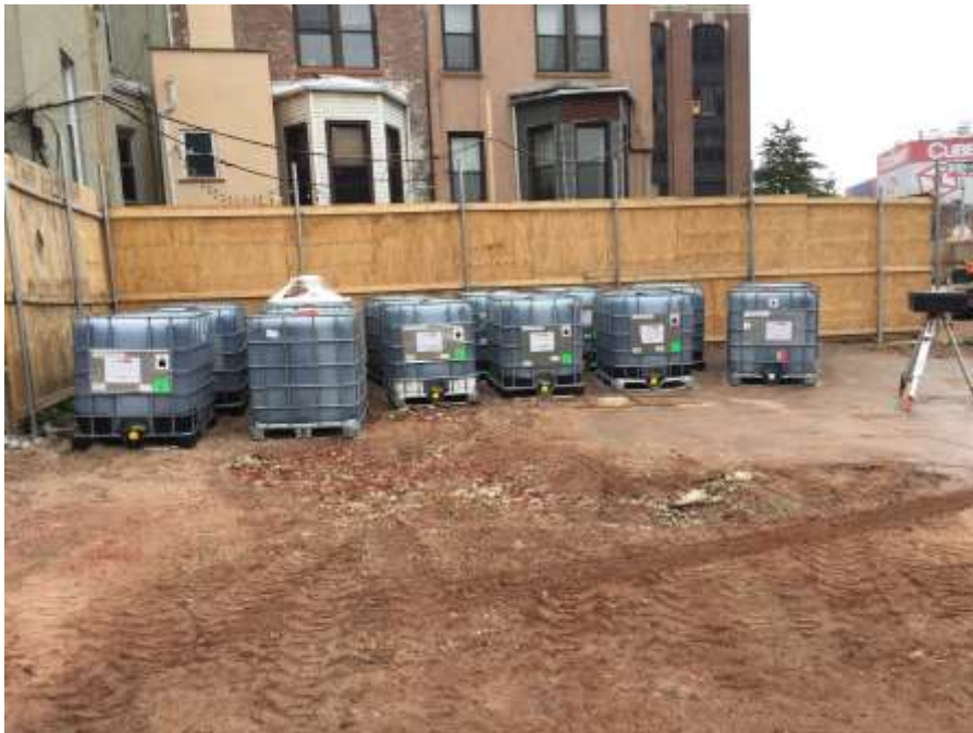
Photo 2: PlumeStop tote staging area and upwind CAMP station (facing east).