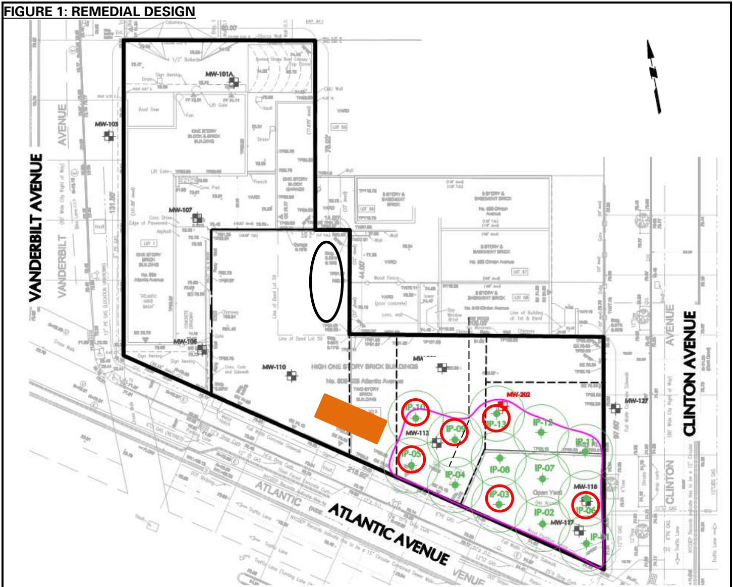
FIGURE 1: REMEDIAL DESIGN