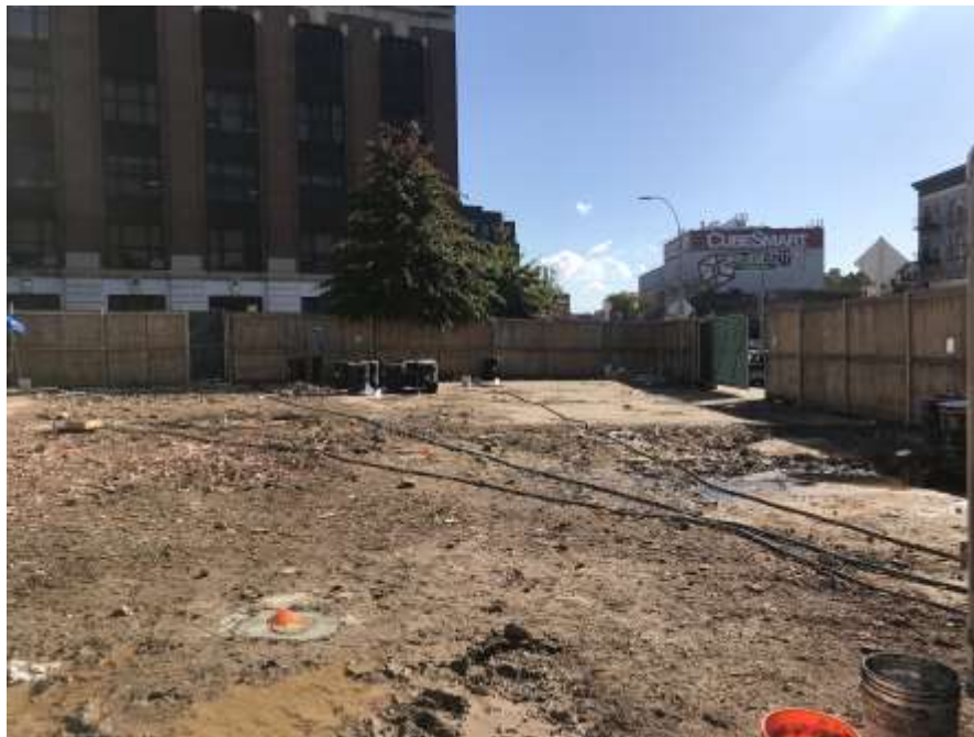
Photo 2: Hoses connected to injection points IP-05, IP-06, IP-11, and IP-13, facing east.

Cc: K. Del Col, S. Knoop, M. Burke (Langan)