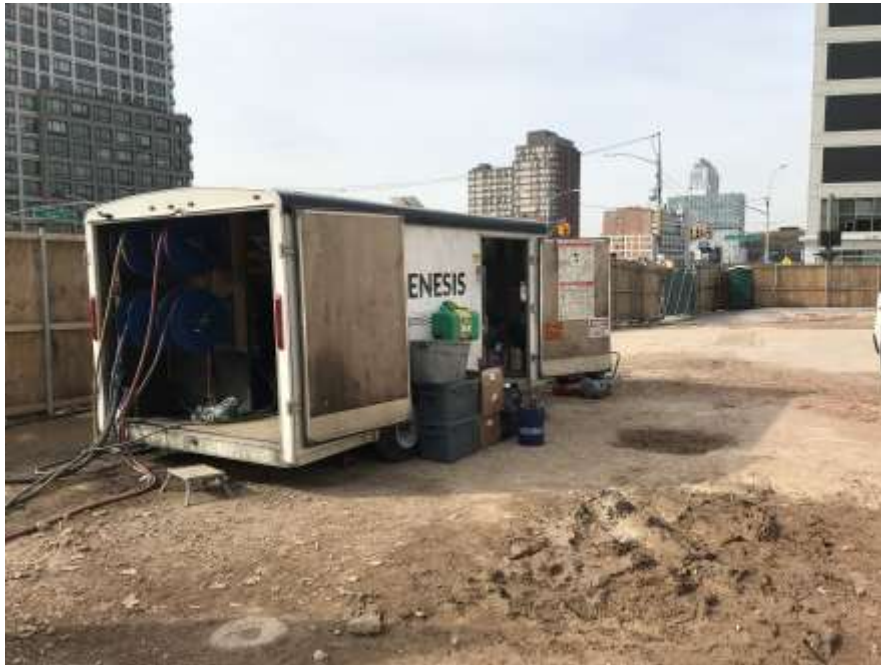
Photo 1: Regenesis trailer containing pumping equipment facing west.