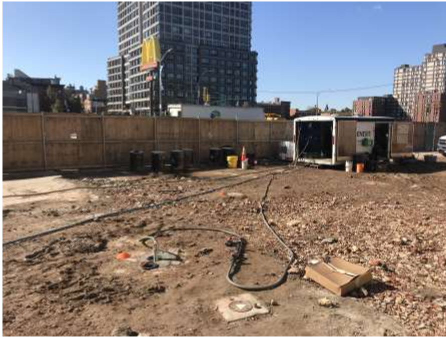
Photo 1: Regensis trailer and injection hoses connected to injection points IP-05, IP-06, IP-11, and IP-13, facing southwest.