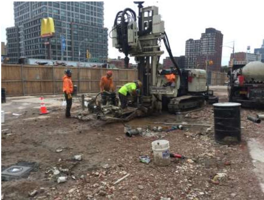
Photo 1: AARCO backfilling the annulus of IP-13 with a grout slurry (facing west).