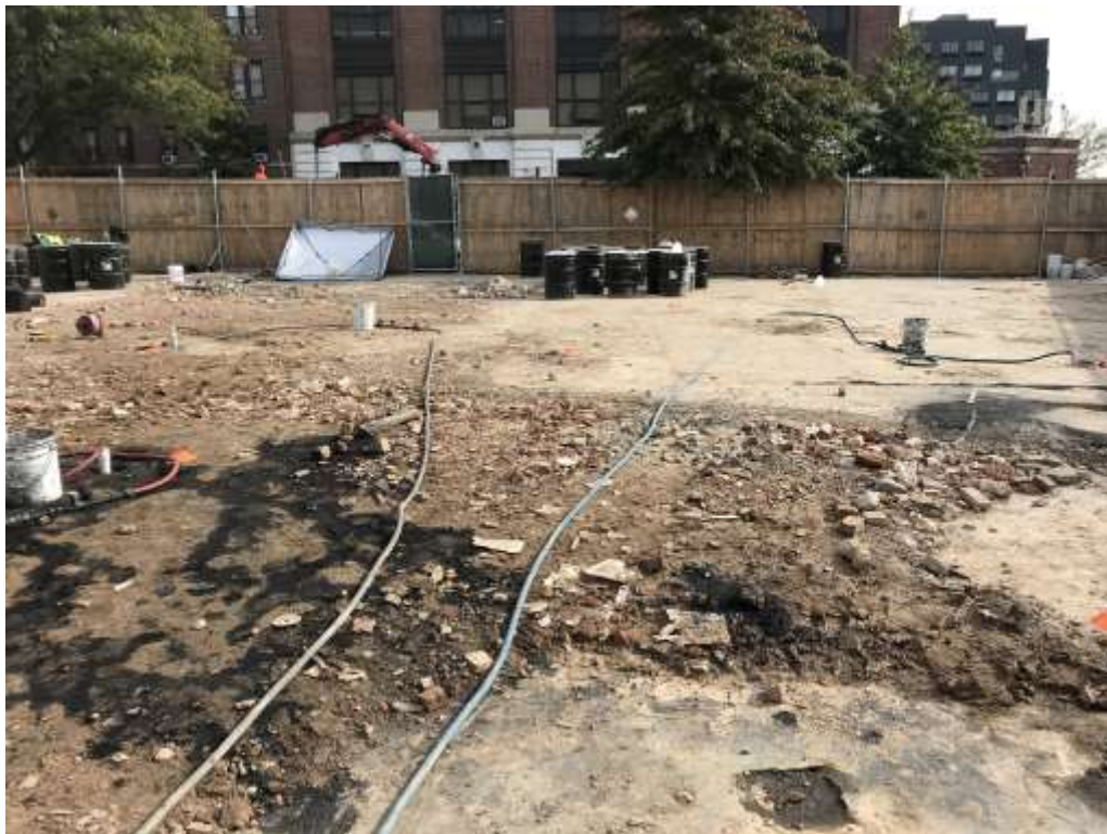
Photo 2: Hoses run to injection points IP-09 and IP-13, facing east.

Cc: K. Del Col, S. Knoop, M. Burke (Langan)