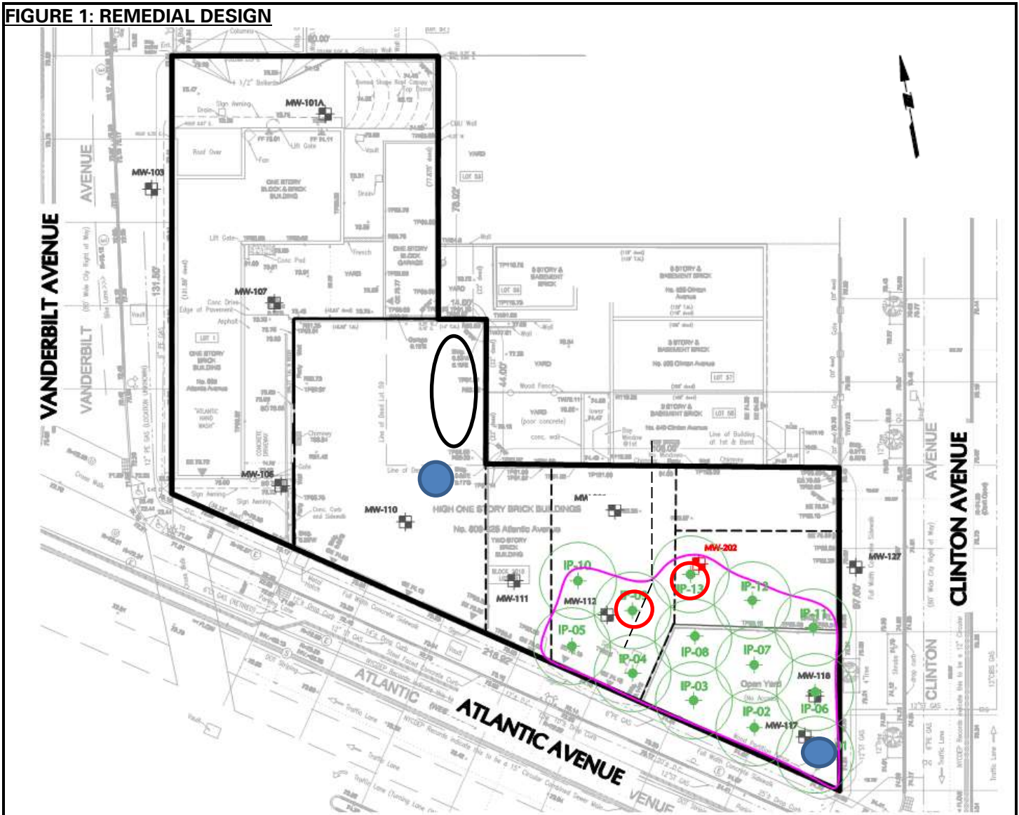
FIGURE 1: REMEDIAL DESIGN