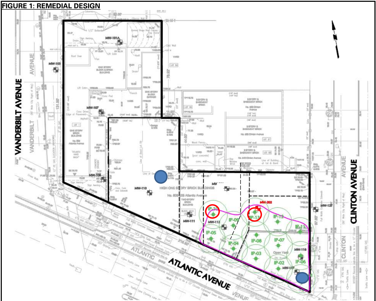
FIGURE 1: REMEDIAL DESIGN