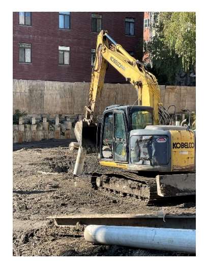
Photo 3: Excavation and installing new suction point in the middle of the site.