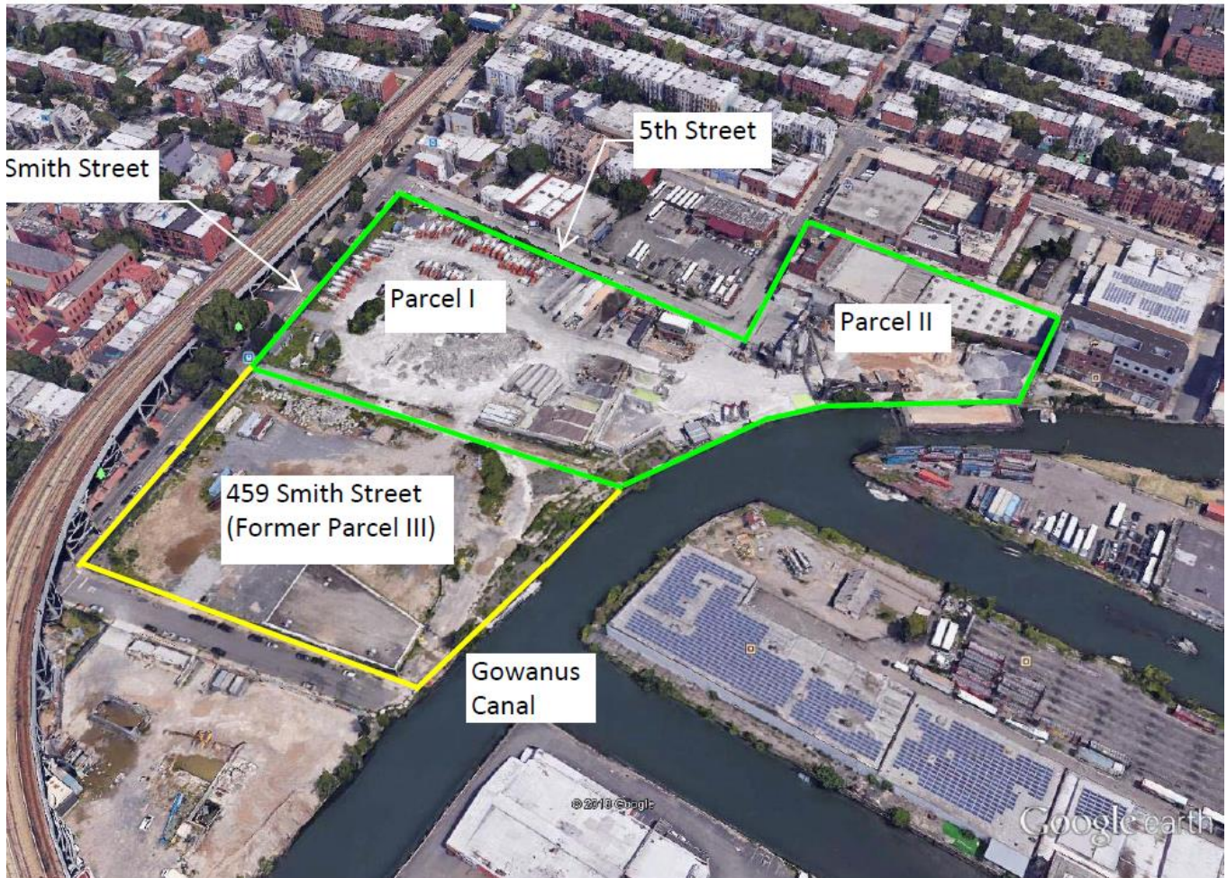
Figure 1 Site Location Brooklyn, NY