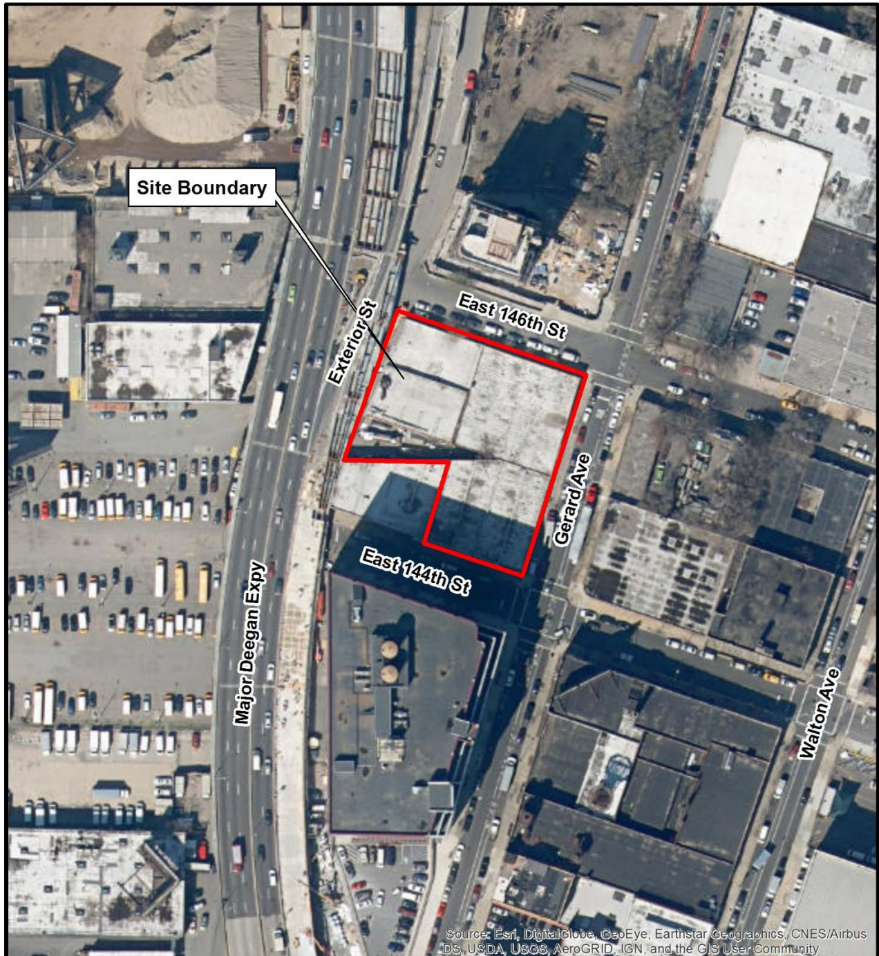
Site Location Map