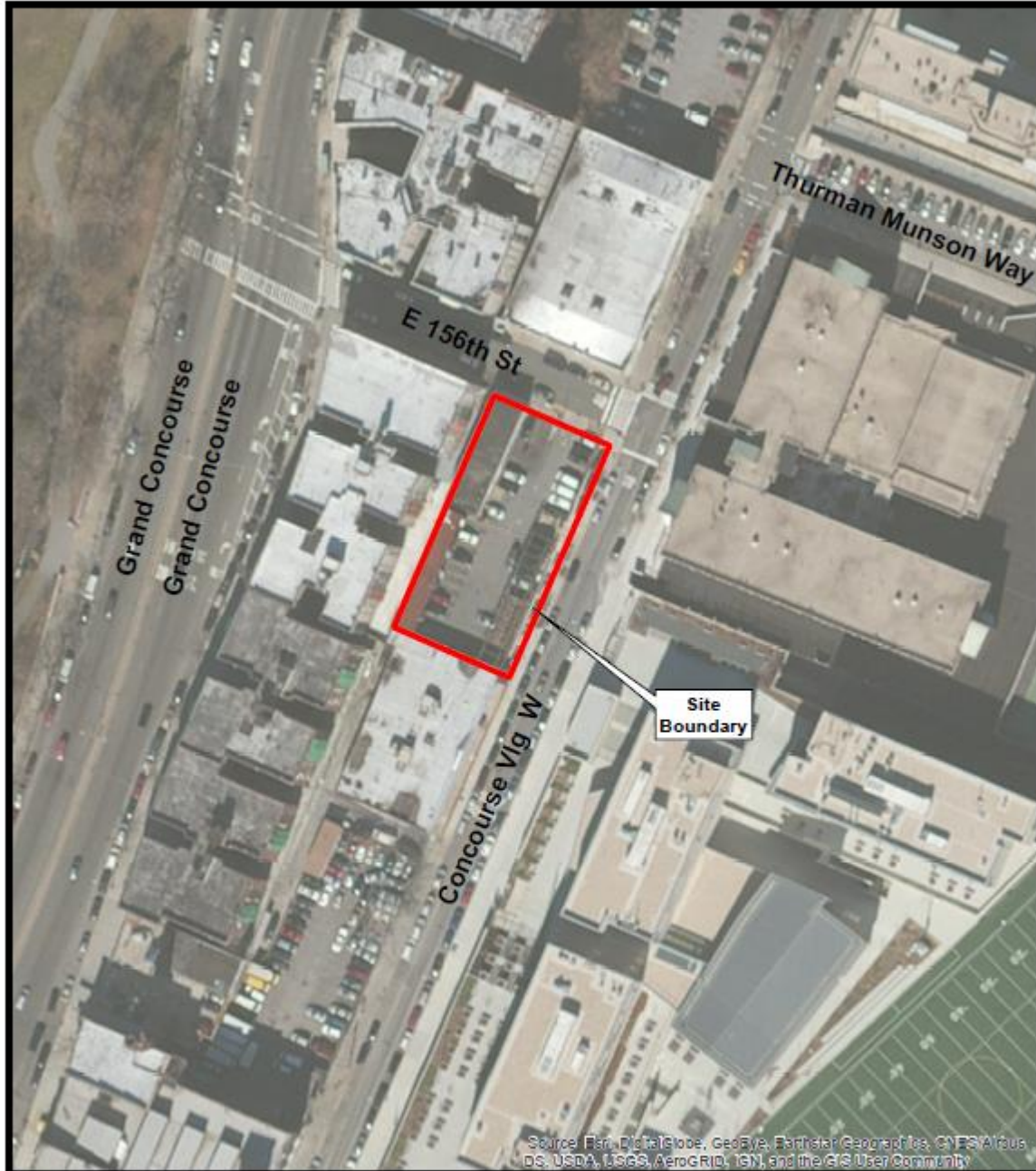
Site Location Map