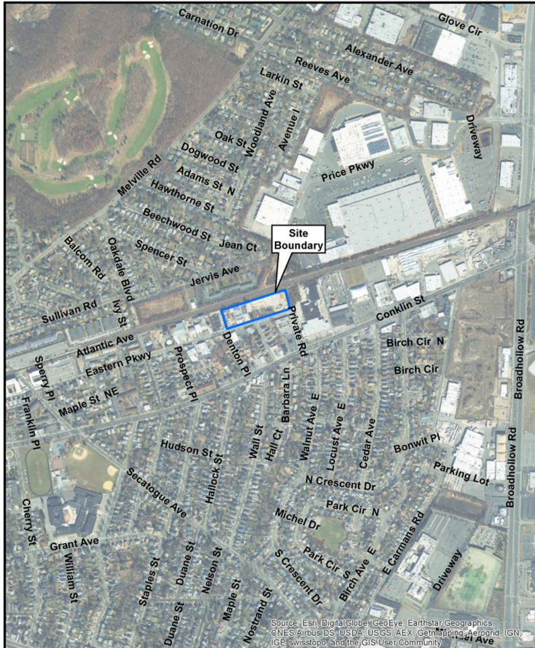
Site Location Map