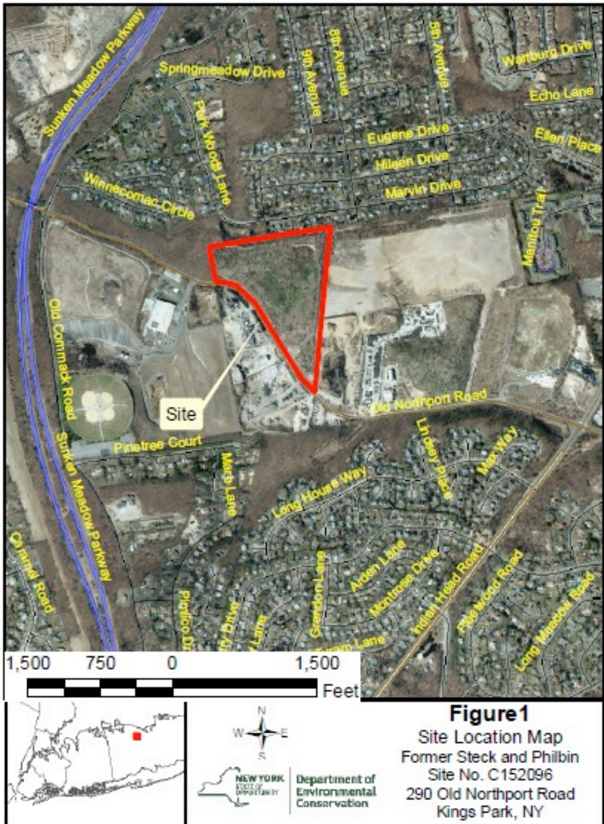
EXHIBIT A SITE MAP