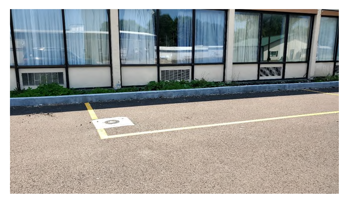
Photo 4 – Looking south at MW-22-01 and the asphalt Site cover system.