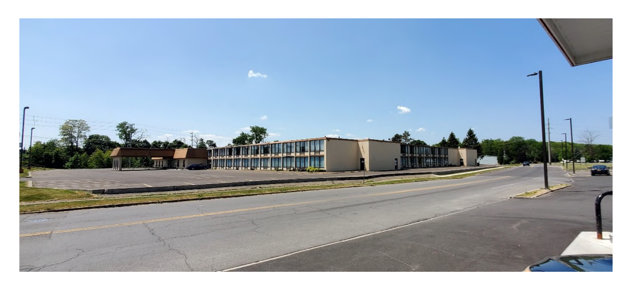
Photo 1 – Looking southwest at an overview of the Site, including the northeast corner and northern portion of across West Shore Blvd..

NYSEG Newark Former MGP Site - Newark, NY NYSDEC Site No. 859021 June 1, 2023