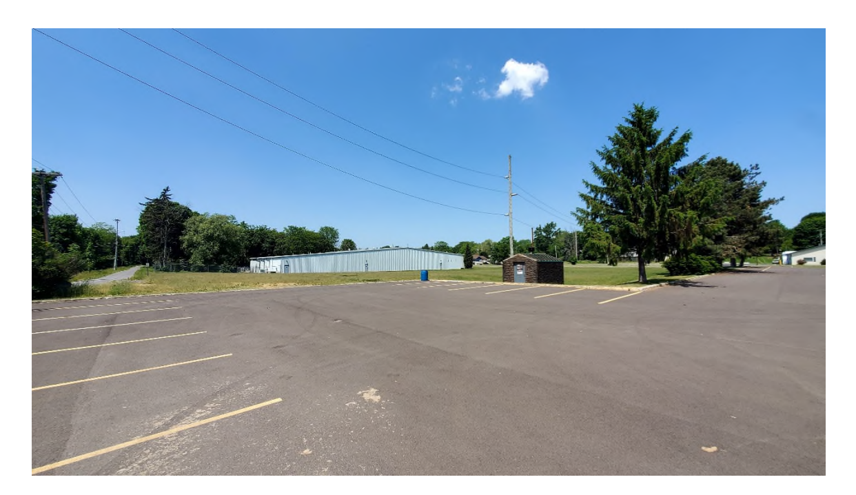
Photo 6 – Looking northwest at the NYSEG gas regulator building and IDW (purge water from groundwater sampling) drum staged on asphalt pavement near the NYSEG-owned property located southwest of the Site.