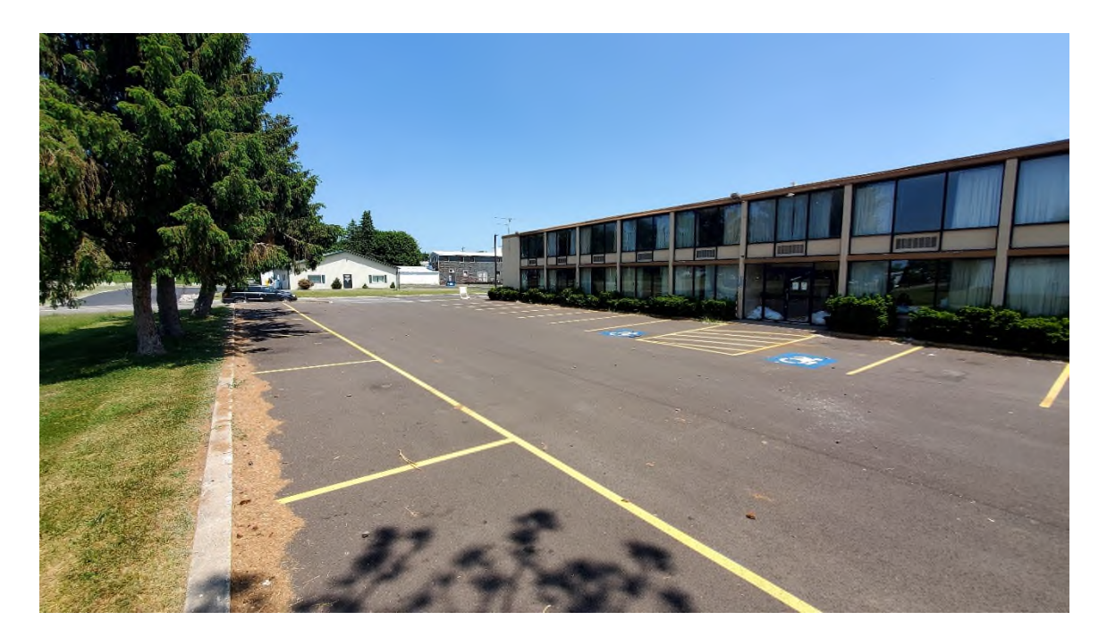
Photo 2 – Looking north across the west and northwest portion of the Site.