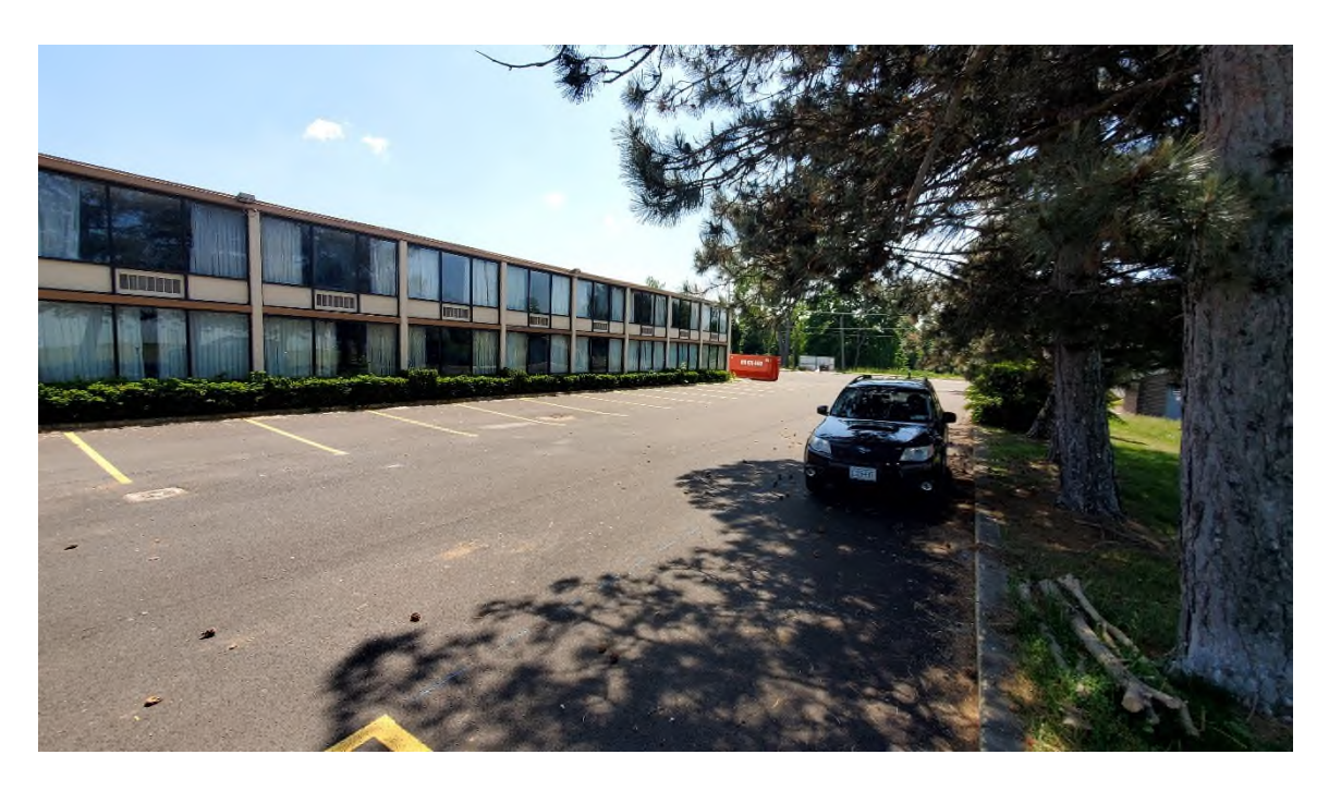
Photo 3 – Looking southeast across the west portion of the Site. MW-10-01 visible in the asphalt parking lot on the left.