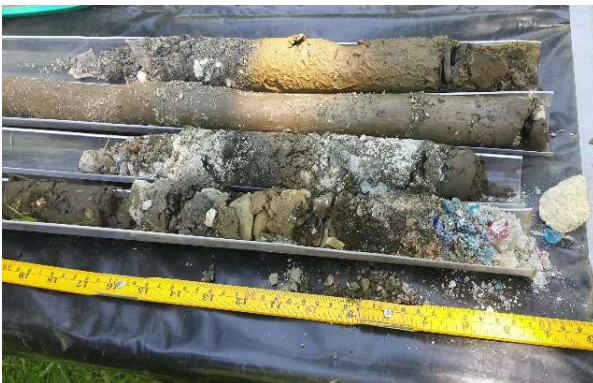
Examples of ABG encountered in the Study Area

The primary types of industrial wastes that have been identified throughout the Corning area include ABG. These materials are of concern to the DEC because they represent a potential human health hazard. If you observe ABG on your property or elsewhere in the area, please do not disturb the material and contact the DEC immediately. Any waste that is encountered should be presumed to be hazardous until sampling is completed and results demonstrate otherwise.