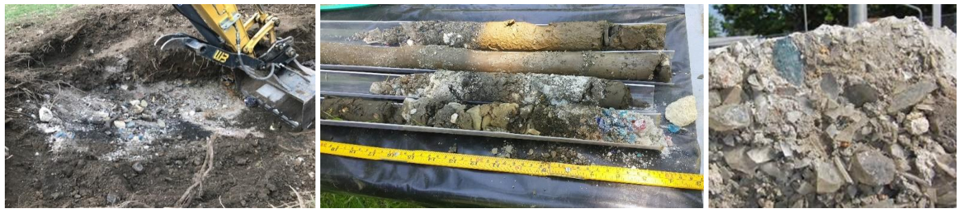
Examples of ash/brick/glass encountered in the Study Area

DEC recognizes that there are times when advance notice is not practical and a property owner is requested to notify DEC and Corning Incorporated for activities that had contact with a cover system that was installed on the property or with ash, brick, and glass materials as soon as the property owner can. DEC and/or Corning Incorporated will provide a written response on the next steps and any additional requirements pursuant to the Site Management Plan.