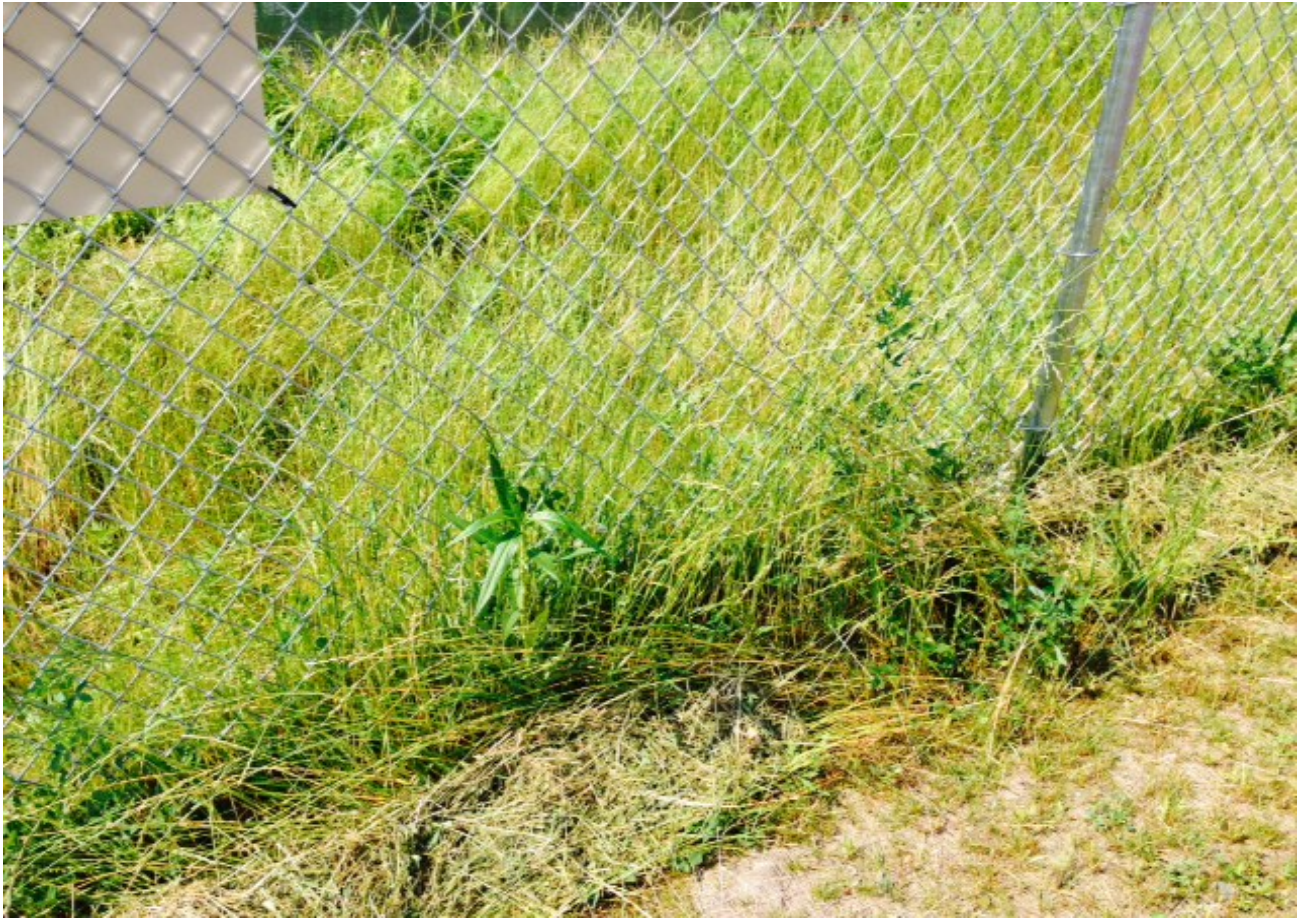
Photo 10 - Vegetation in Fence