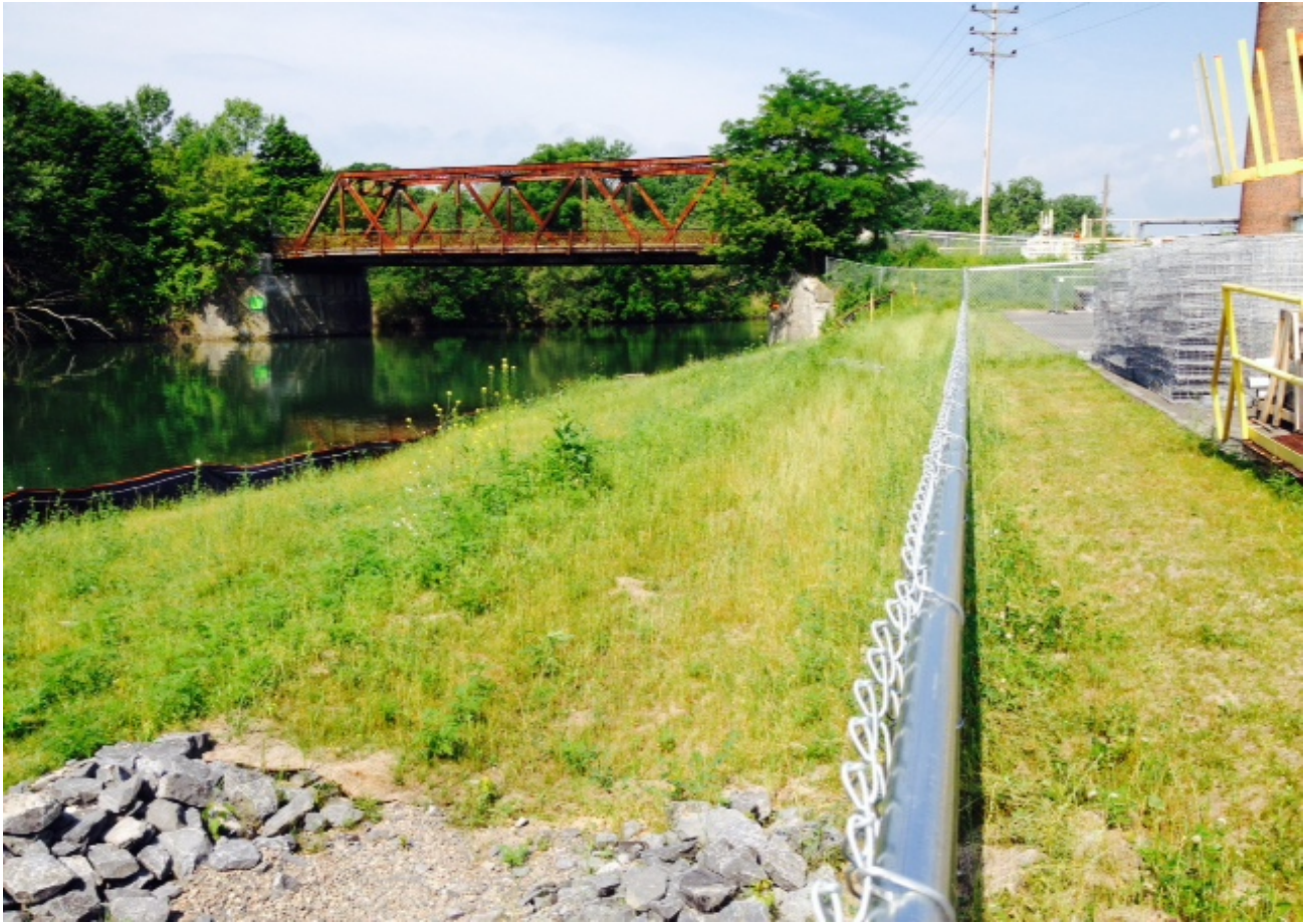
Photo 7 - Vegetation Along Canal Bank