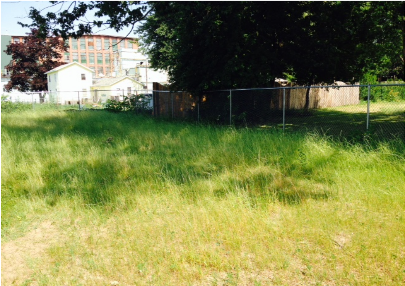
Photo 6 - Vegetation in Cap Area - Looking Northwest