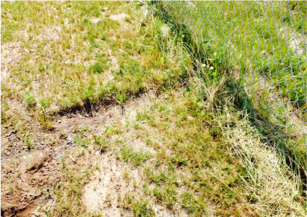
Photo 13 - Minor Erosion Near Edge of Asphalt Cap