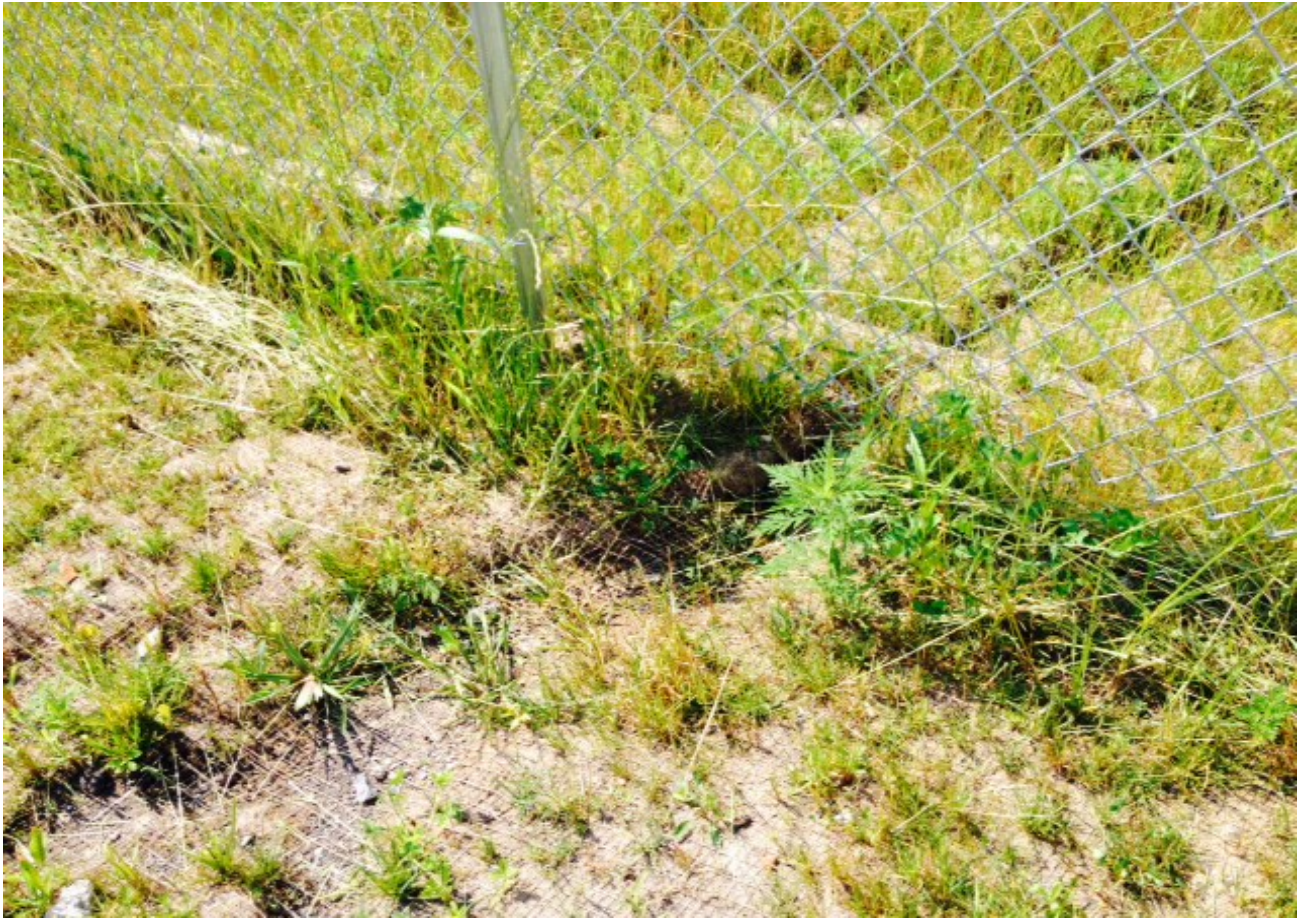
Photo 12 - Minor Erosion Near Edge of Asphalt Cap