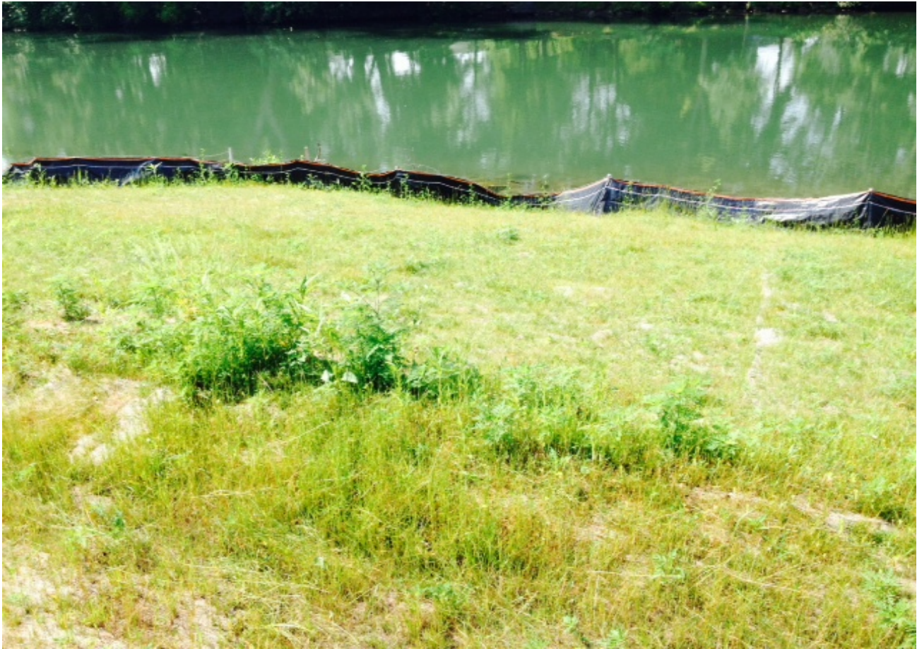
Photo 8 - Vegetation Along Canal Bank