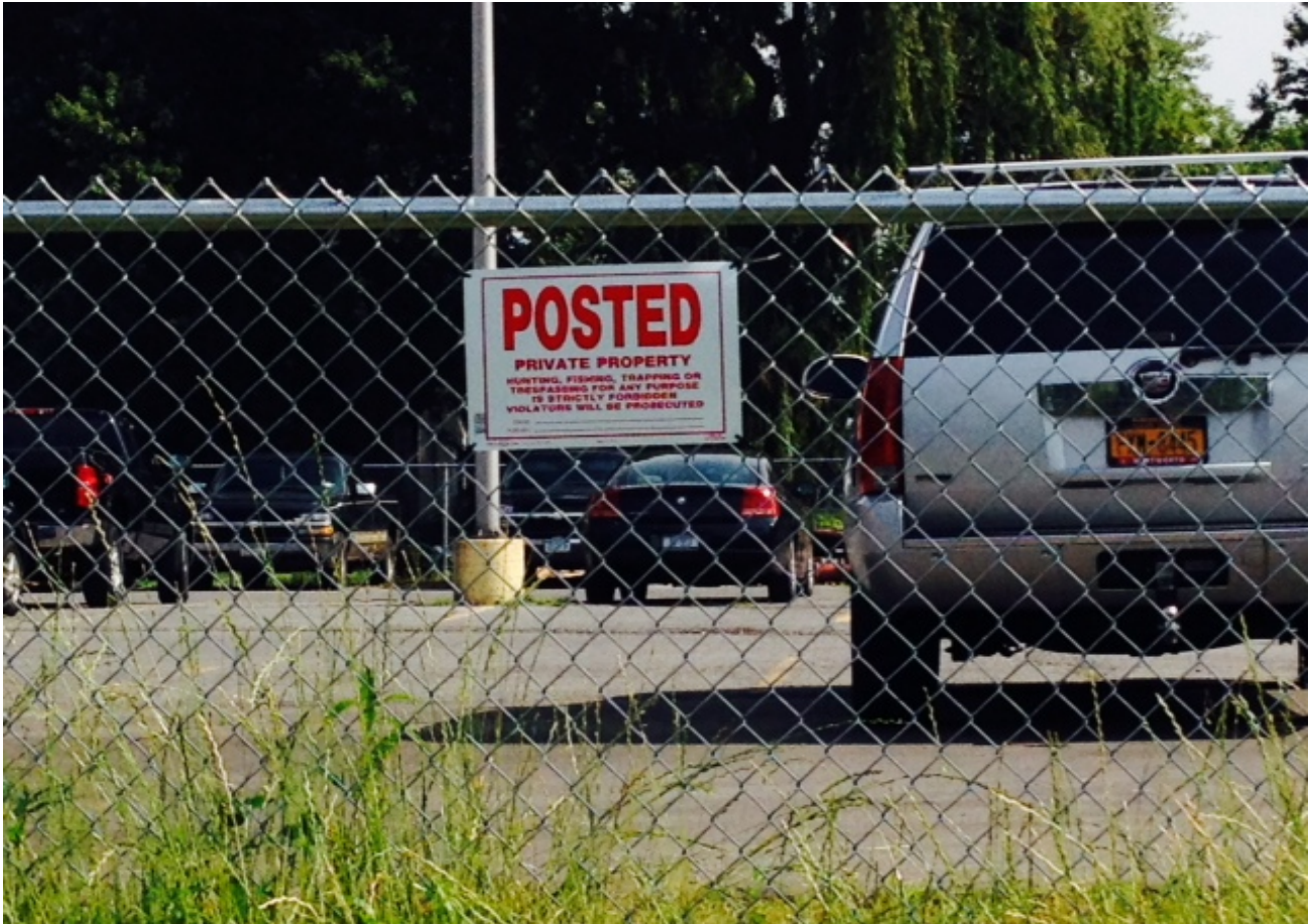
Photo 1 - Typical Posted No Trespassing Sign on Canal Side