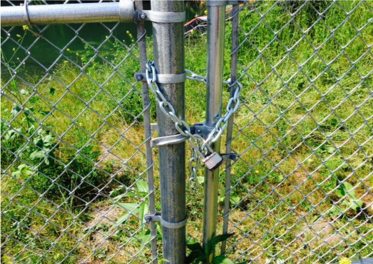
Photo 3 - Typical Locked Man Gate