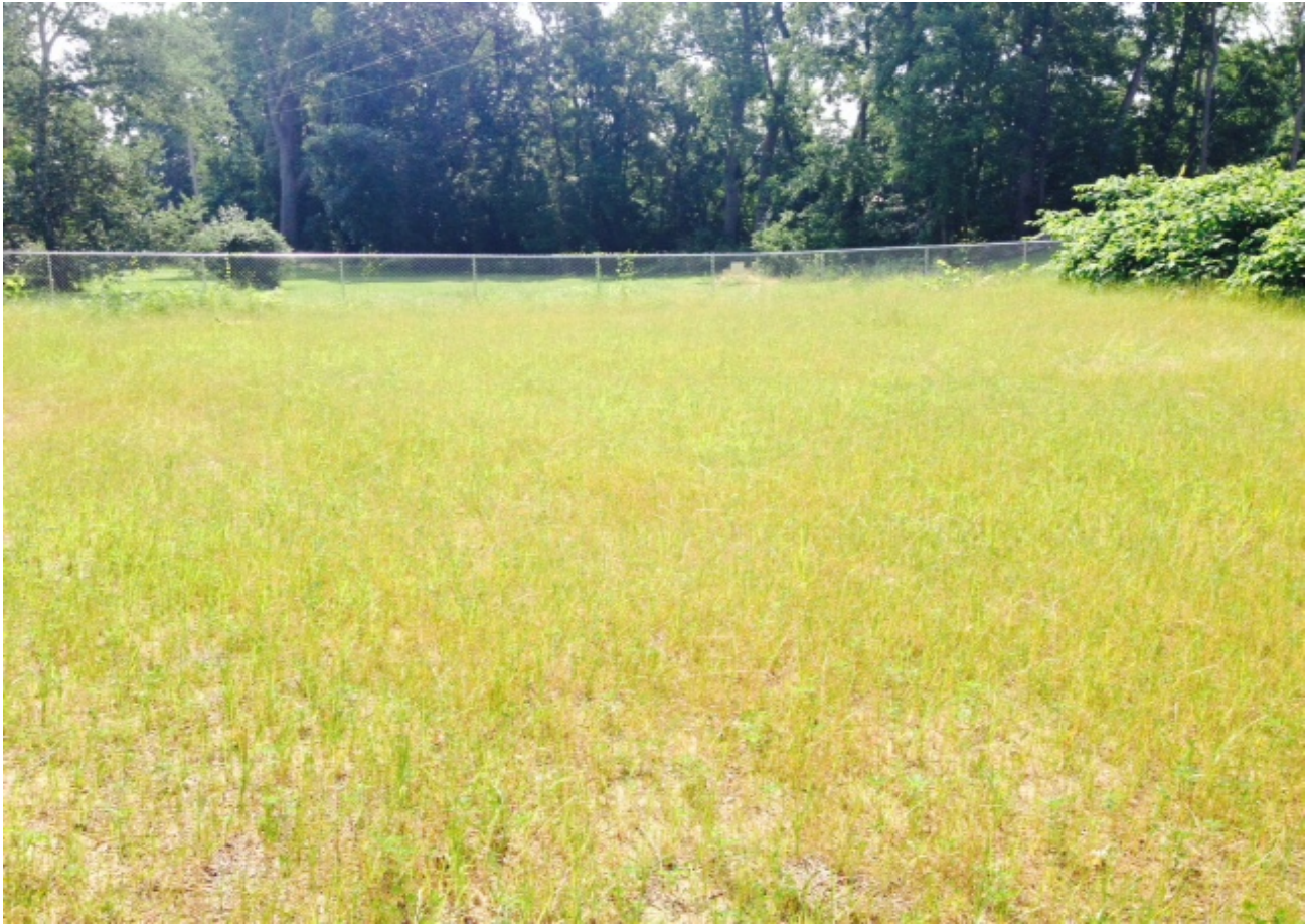
Photo 5 - Vegetation in Cap Area - Looking East