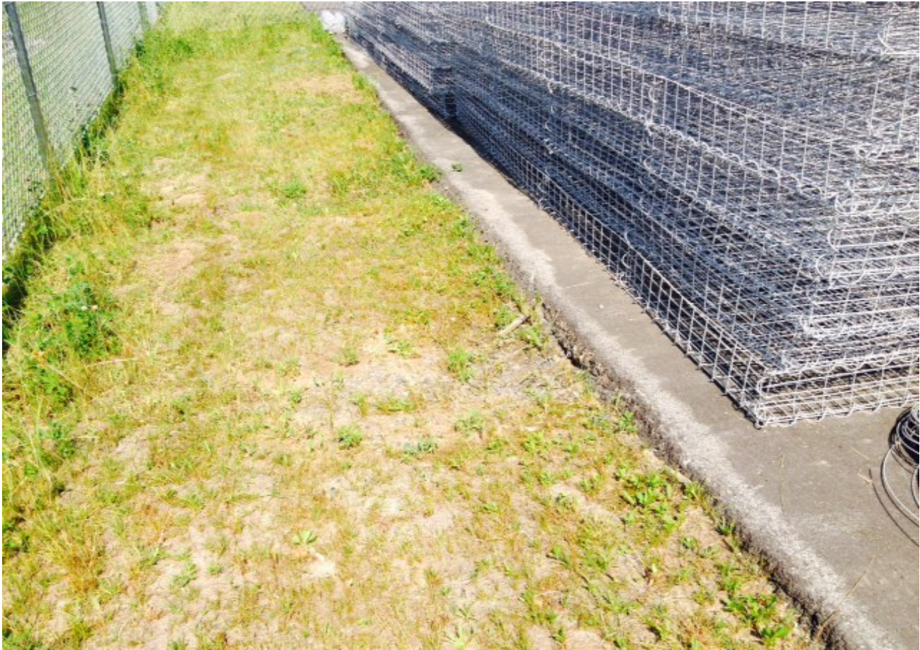
Photo 9 - Vegetation Near Asphalt Cap and Minor Erosion