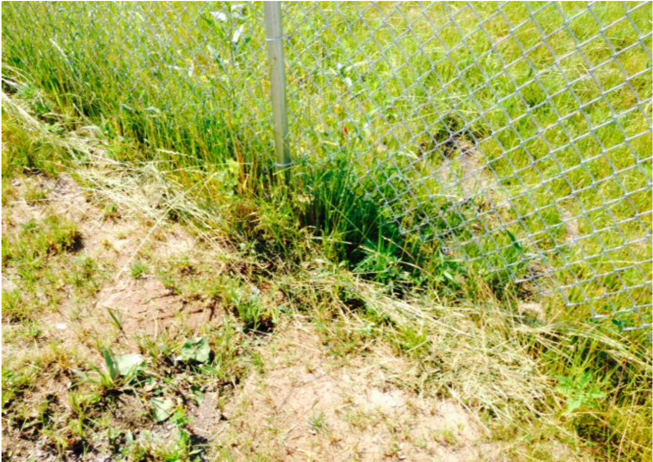
Photo 11 - Vegetation in Fence