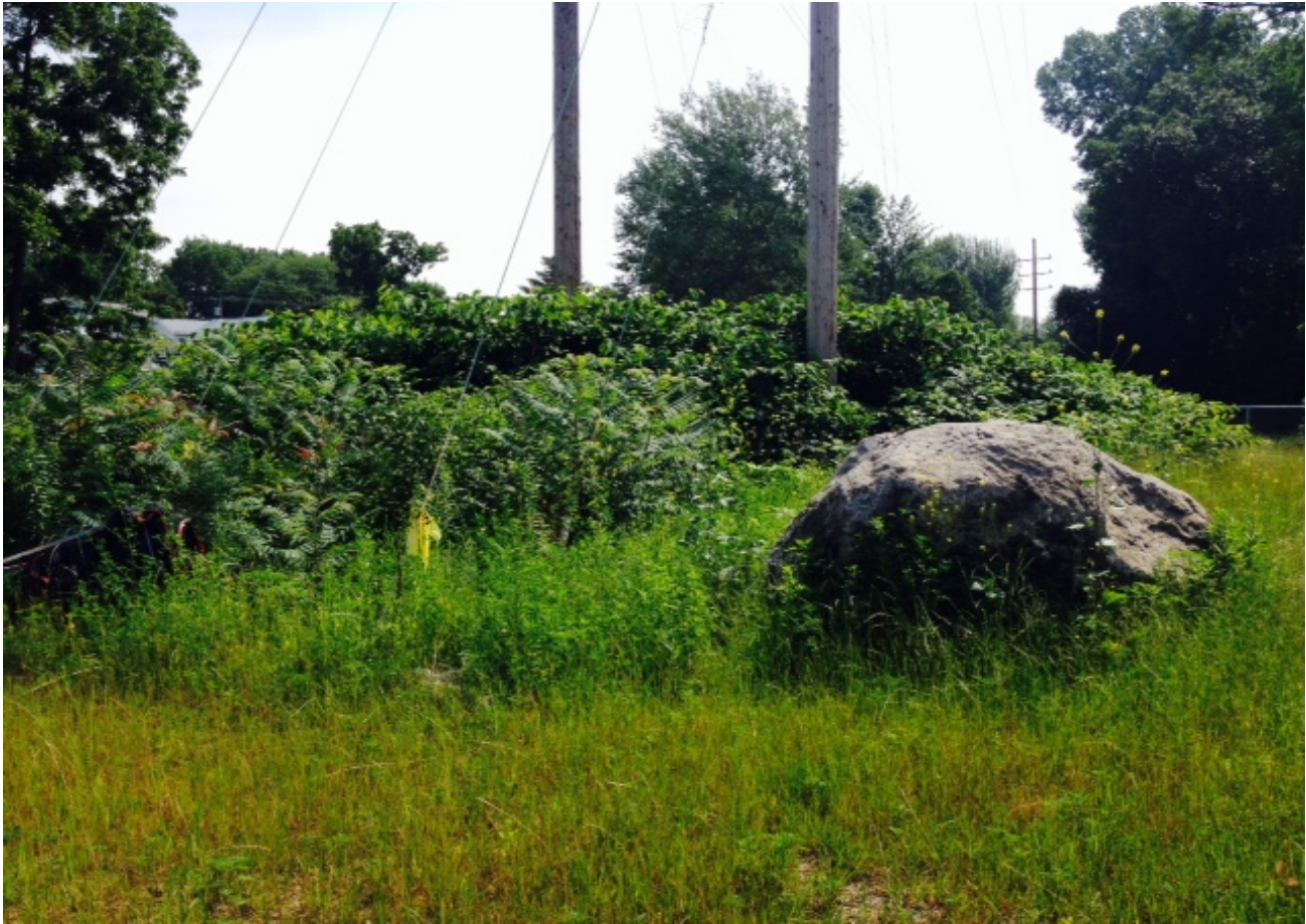
Photo 4 - Vegetation Around Power Poles and Guy Wire