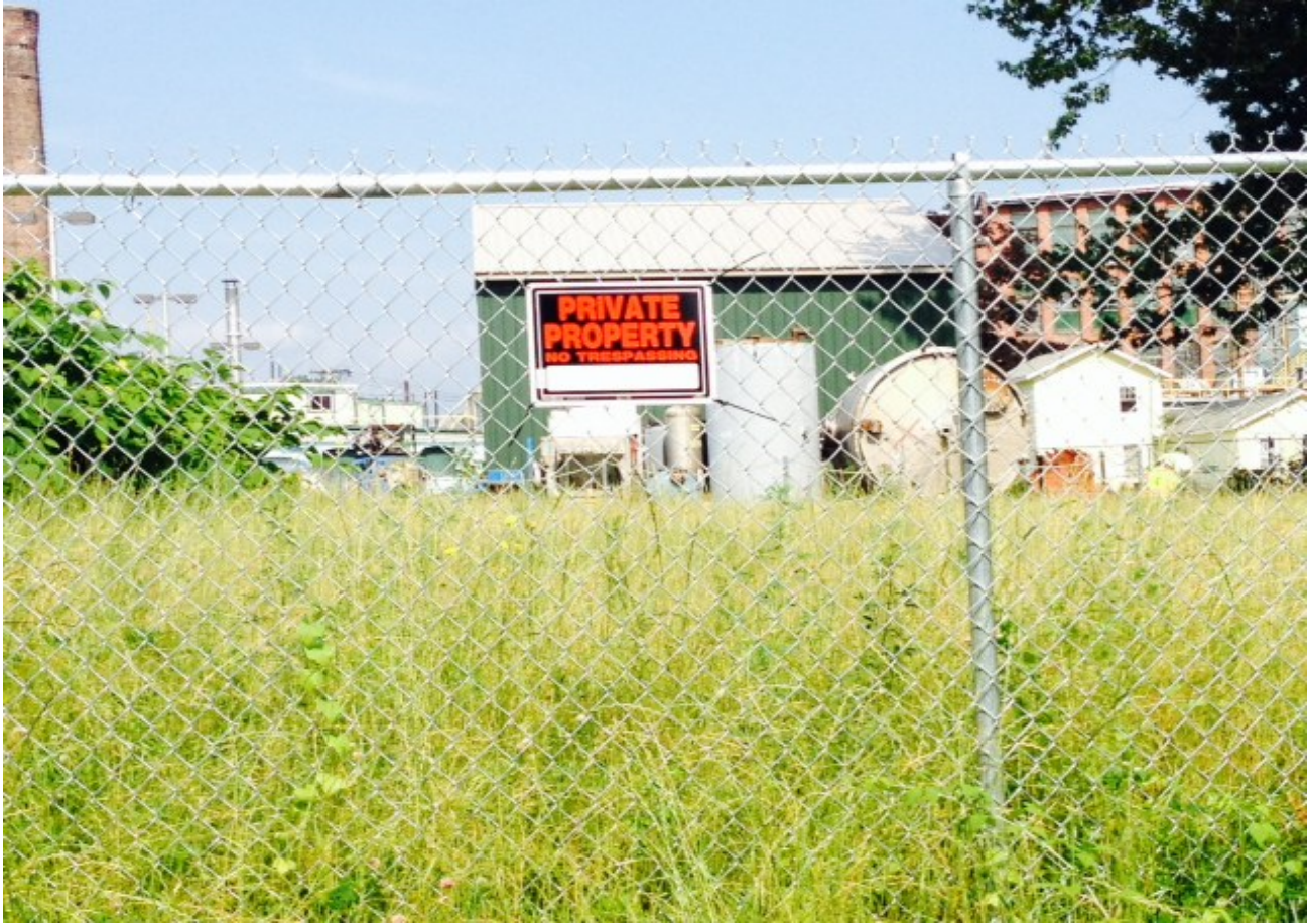
Photo 2 - Typical Posted No Trespassing Sign on East and North Side of Cap Area