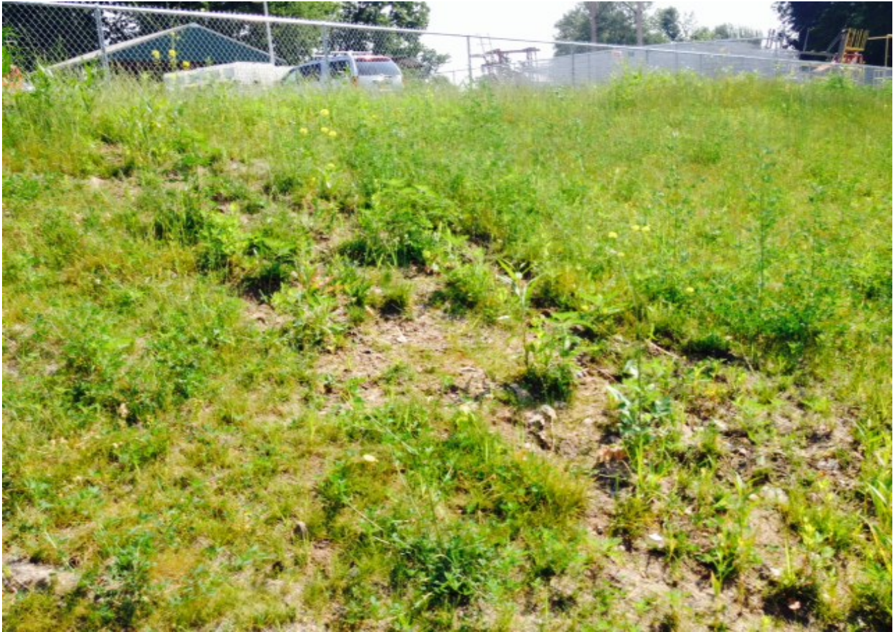
Photo 14 - Minor Erosion on South Side of Fence, North of Canal Bank