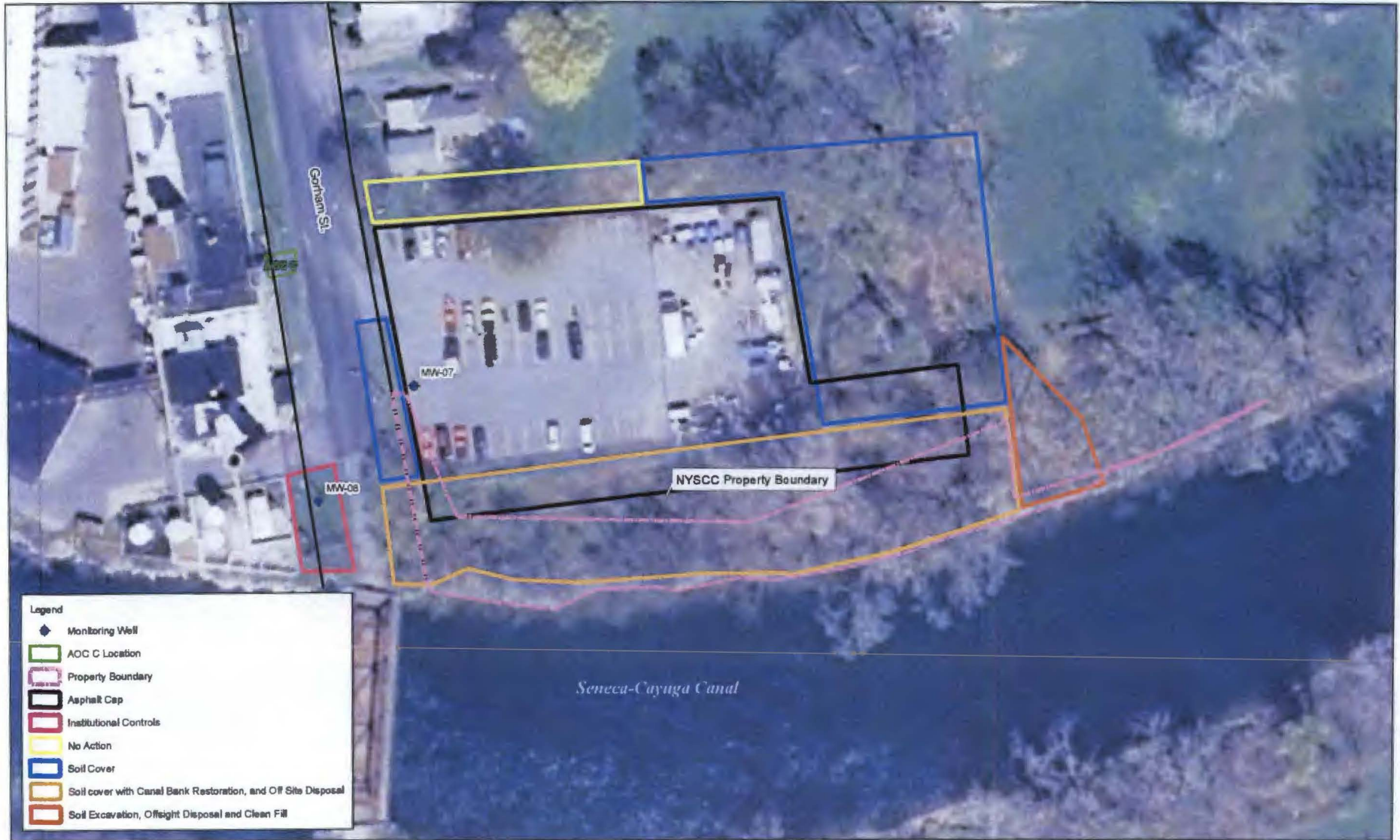
Figure 1 Interim Operations and Maintenance Plan / Periodic Review Inspection Area 2014 Periodic Review Report for Garham Street Area Former Hampshire Chemical Corp. Facility Waterloo, New York