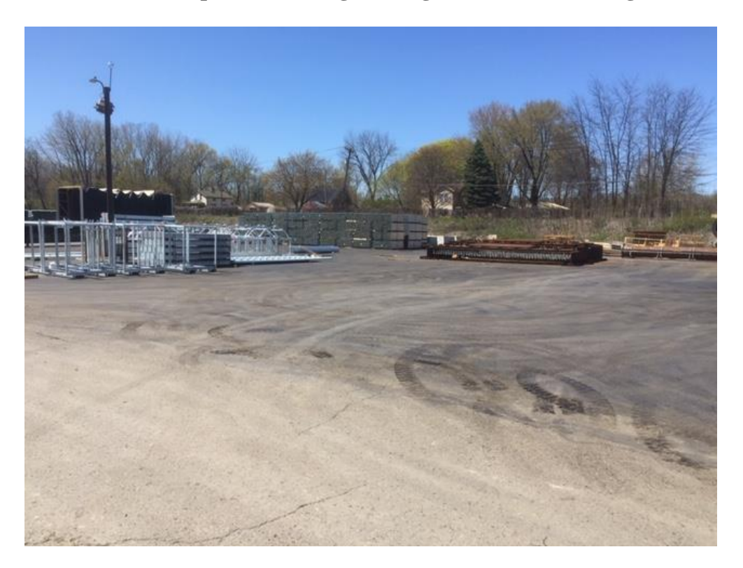
Photo No. 6 – Asphalt seal area view of Area A – viewing northwest.