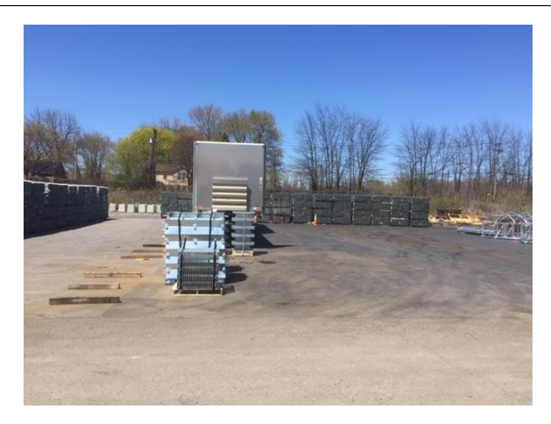
Photo No. 3 – Asphalt seal along west edge of Area A – viewing north.