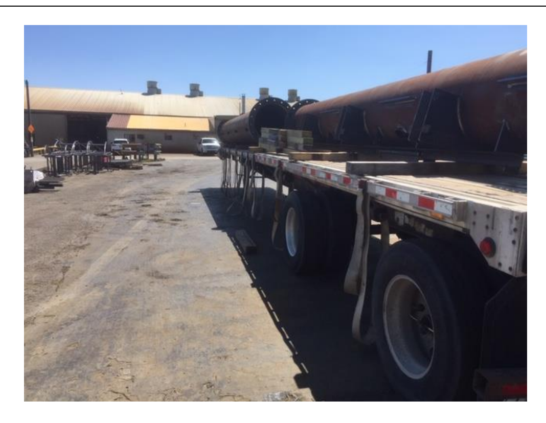
Photo No. 5 – Asphalt seal along east edge of Area A – viewing south.