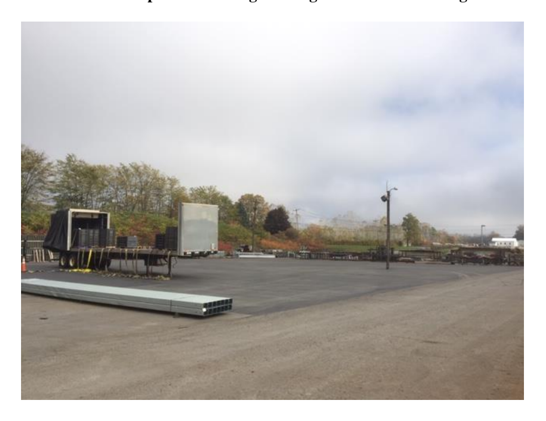
Photo No. 6 – Asphalt seal area view of Area A – viewing northeast.