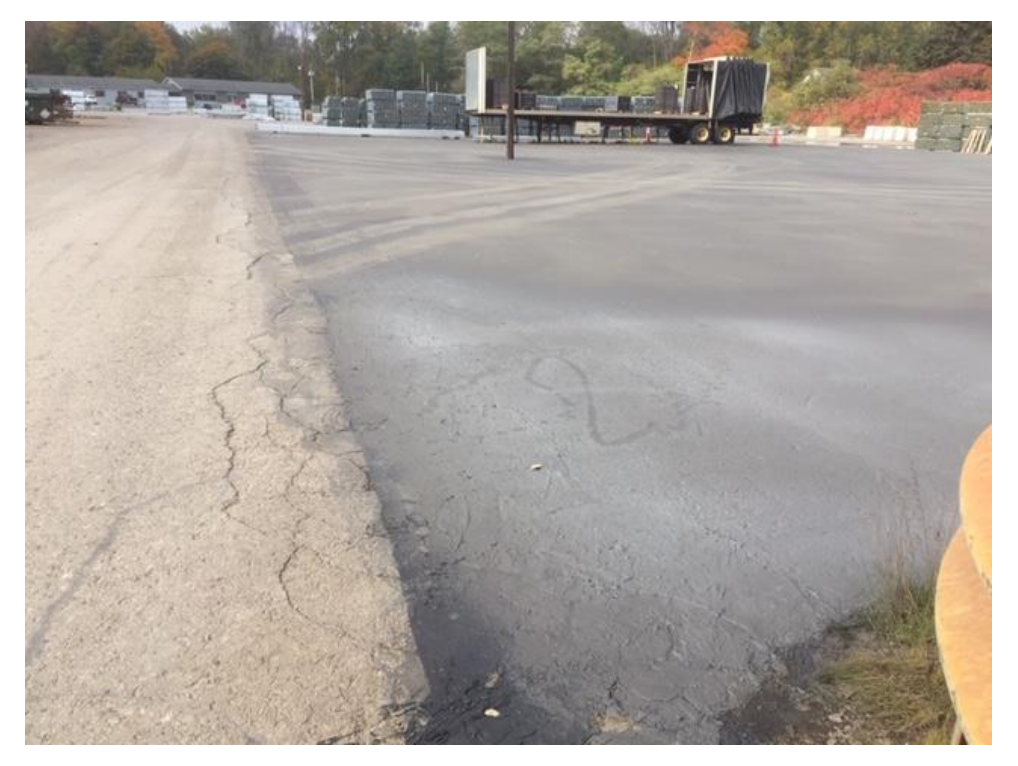
Photo No. 2 – Asphalt seal along south edge of Area A – viewing west.