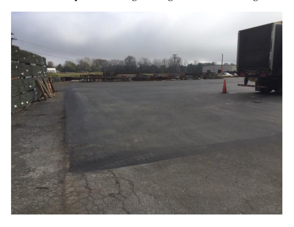
Photo No. 4 – Asphalt seal along north edge of Area A – viewing east.