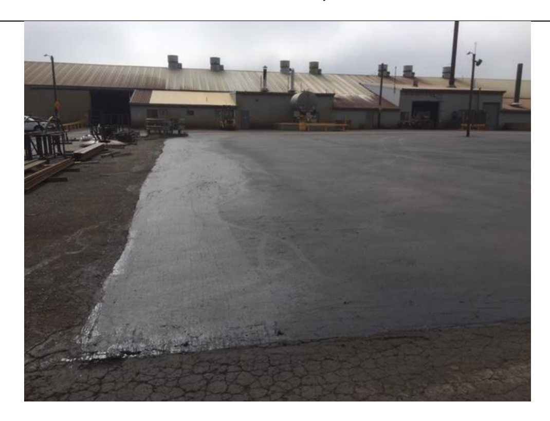
Photo No. 5 – Asphalt seal along east edge of Area A – viewing south.

Representative Photos Elderlee, Inc. Site No. - 835014 Date: October 21, 2019