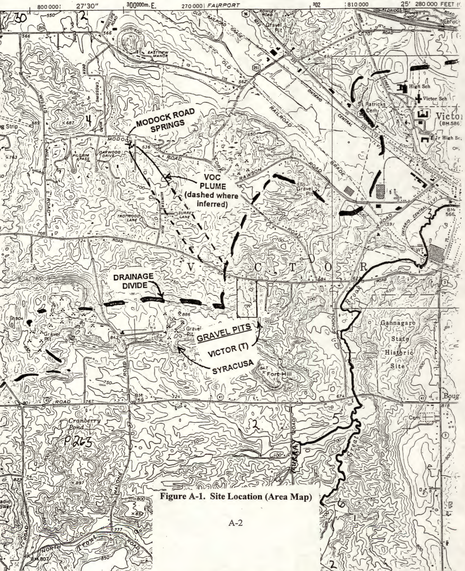
Figure A-1. Site Location (Area Map)