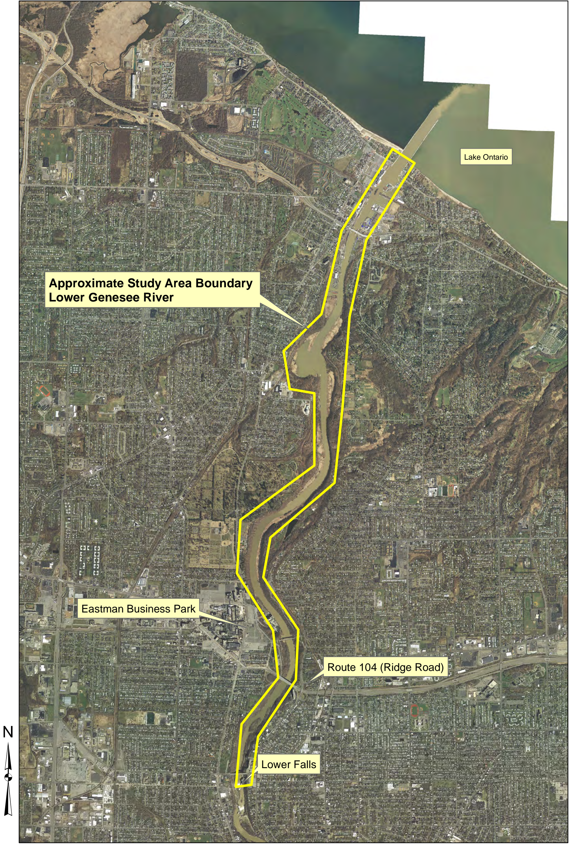
Figure 1 - Site Location Map Lower Genesee River - Rochester, New York