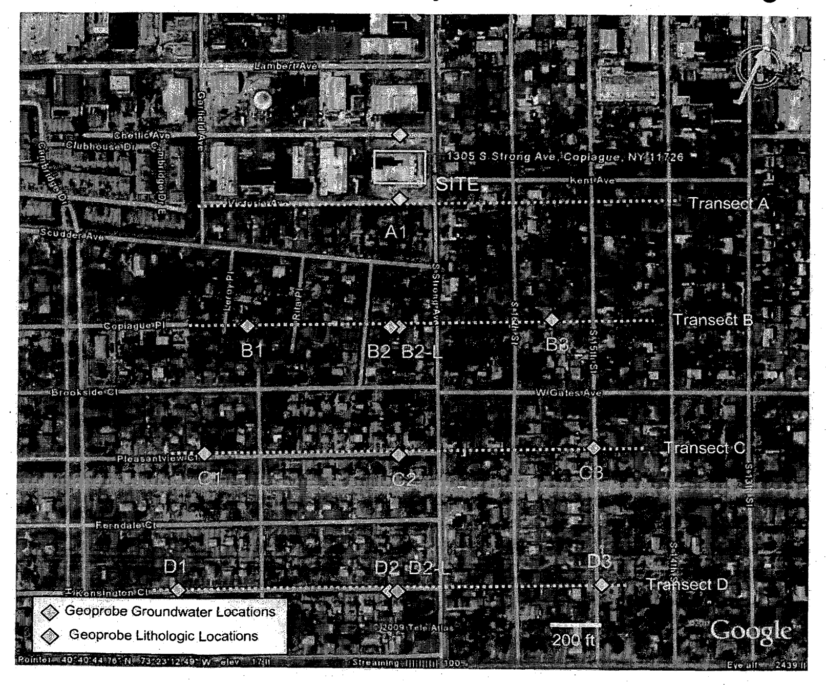
Figure 2: Off-Site Levey Property Groundwater Investigation