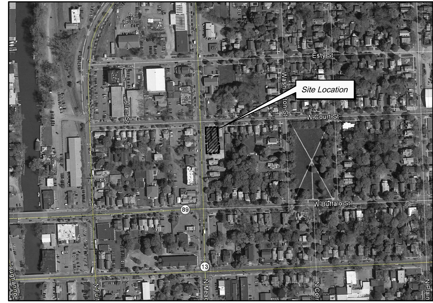
SITE VICINITY MAP NOT TO SCALE